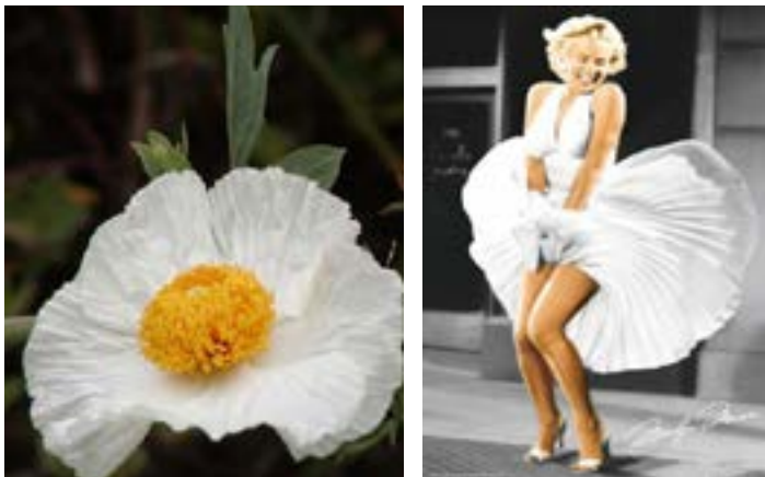
Figure 2. Romneya, the fried egg flower (left). Can you see why the flower may also invoke Marilyn Monroe (right)?

is that we now recognize pronghorns to be more closely related to other antelope species than goats. Even Clark noted “he is more like the Antelope or Gazella of Africa than any other Species of Goat” (Smithsonian Museum of Natural History, nd). The name ‘pronghorn antelope’ would not show up until 1826 (Oxford English Dictionary, 2013). The switch to stress a more phylogenetically accurate name would seem almost inevitable, but science is not always so self-correcting.