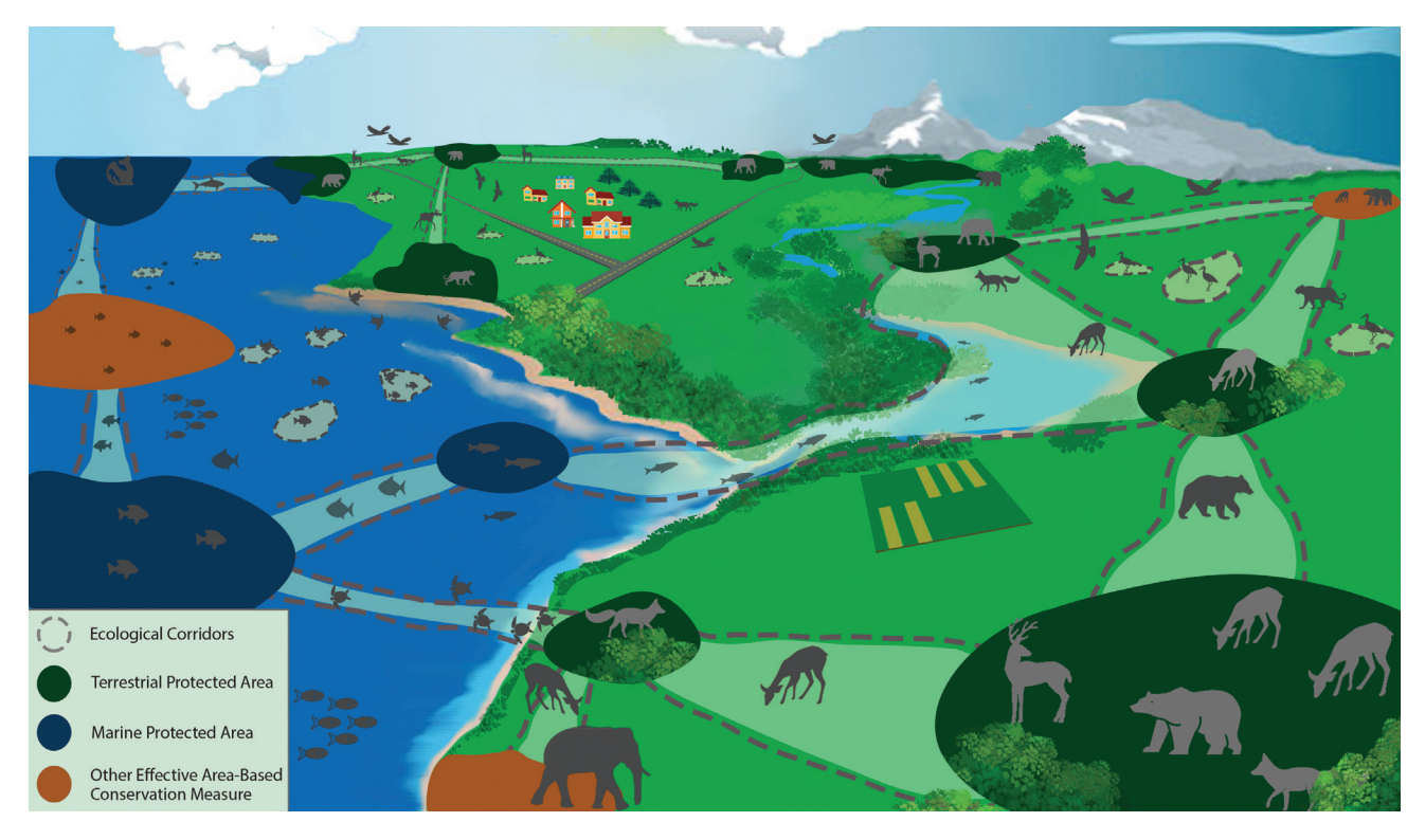
Figure 1. A conceptual representation of an ecological network for conservation. Terrestrial protected areas are in dark green and depicted as surrounded by human activities. Marine protected areas are in dark blue. OECMs are represented in orange. Ecological corridors, both those that are continuous and those that function as stepping stones, are outlined with dashed lines. The ecological network for conservation includes protected areas, OECMs and ecological corridors.

tives. Here follow the basic requirements to achieve a conserved ecological corridor (Hilty et al. 2020):