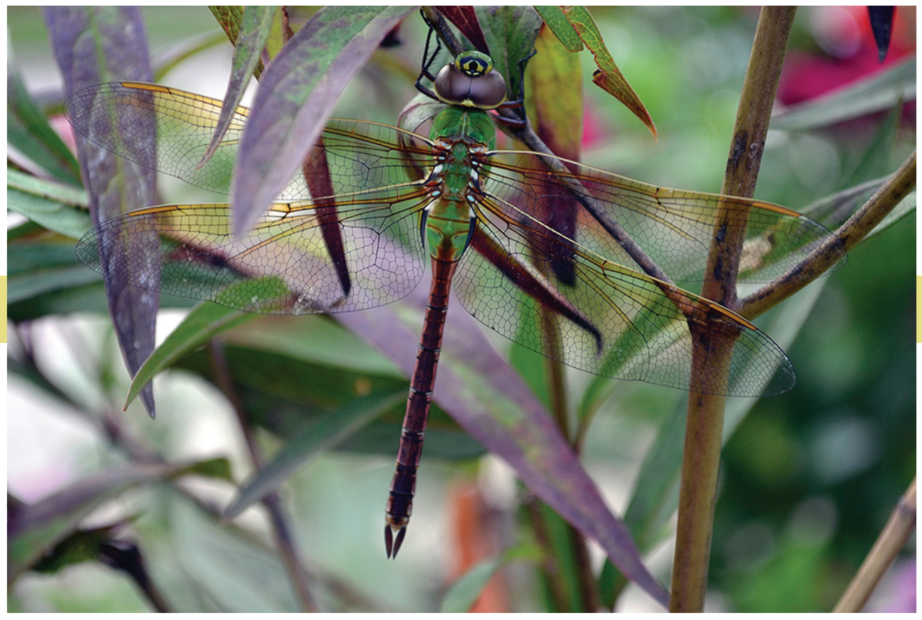
A green darner dragonfly ( Anax junius ) rests. While less well-known than monarch butterflies, these insects also migrate great distances for winter.

85% of wetlands (by area) have been lost (Díaz et al. 2019). On average, population sizes of wild vertebrate species have declined precipitously over the last 50 years on land, in freshwater and in the sea, and around 25% of species in assessed animal and plant groups are threatened (Díaz et al. 2019).