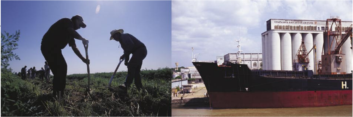
When survey respondents were asked in paired comparisons to choose which aspect of food production that they would like to see represented by third-party-certified eco-labels, 22% picked “locally grown” while 16.5% chose a “living wage” for farmworkers, left , as their top-ranked choices. Right , a grain ship transports the commodity overseas.

wanted to know the country of origin of their food. One participant said, “I guess I’d like to know (where fruits and vegetables are from) because I’d like to know are we producing our food or are we actually reaching out into other countries?” Some participants wanted to support the U.S. economy, while others went further and expressed interest in supporting their local economies. Another stated reason for wanting to know where food came from was concern about the safety of imported food, such as the potential presence of pesticides banned in the United States or contamination with microbes that could cause human diseases. Finally, some participants wanted to know how much fossil fuel was consumed in transporting their food.