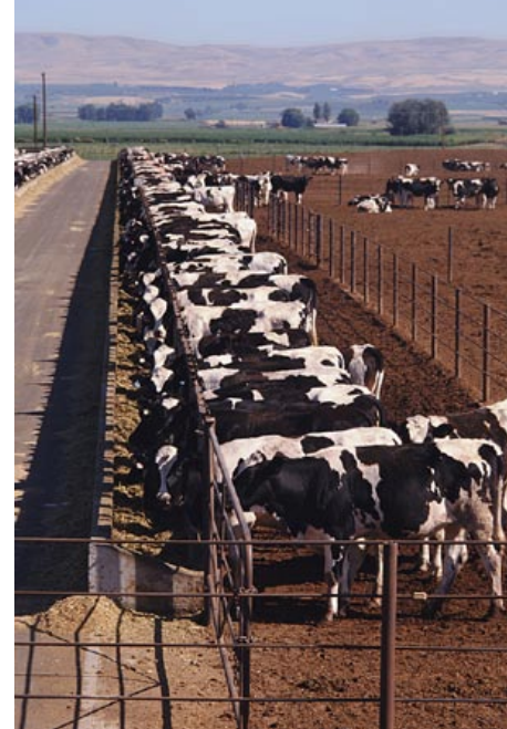
In focus groups, the treatment of food animals elicited the most emotion.

For the topics of working conditions and wages, focus group participants were interested in the treatment of farmworkers, such as backbreaking labor performed for very low pay, and the exploitation of migrant workers. Workers involved in other aspects of the food system, such as processing or retail, were not discussed as frequently. When asked specifically to list criteria they would like to see improved for workers involved in the food system, participants mentioned higher wages, protection from exposure to pesticides, health