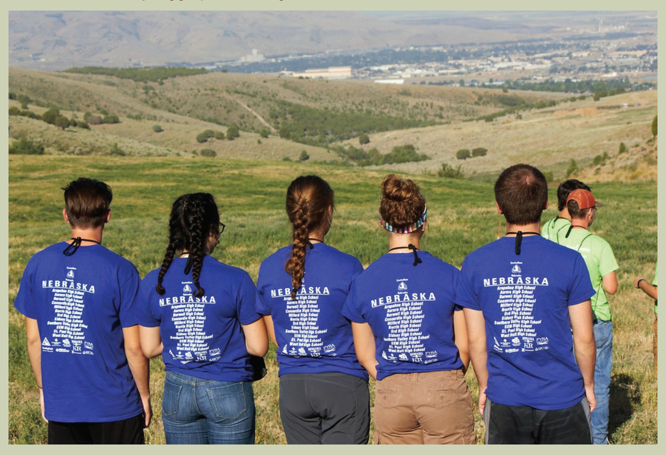
An Envirothon student team ready to engage in place-based learning.

which winning teams from participating US states and Canadian provinces compete for recognition and scholarships by demonstrating their knowledge of environmental science and natural resource management. The program has a strong outdoor component, and is sponsored by the US Forest Service, the US Natural Resources Conservation Service, and others. Much of the field education and field competitions are held in areas protected for their geoheritage and biodiversity values, and this use of geoheritage as a gateway to the broader educational goals is central to the program. The Envirothon's emphasis on both project-based and place-based learning make it a perfect fit for enhancing natural science education in China. By broadening the influence of the Envirothon program and its underlying conservation goals in China, this work provides a platform for project-based learning opportunities and field-based experiences as well as to foster international collaboration.