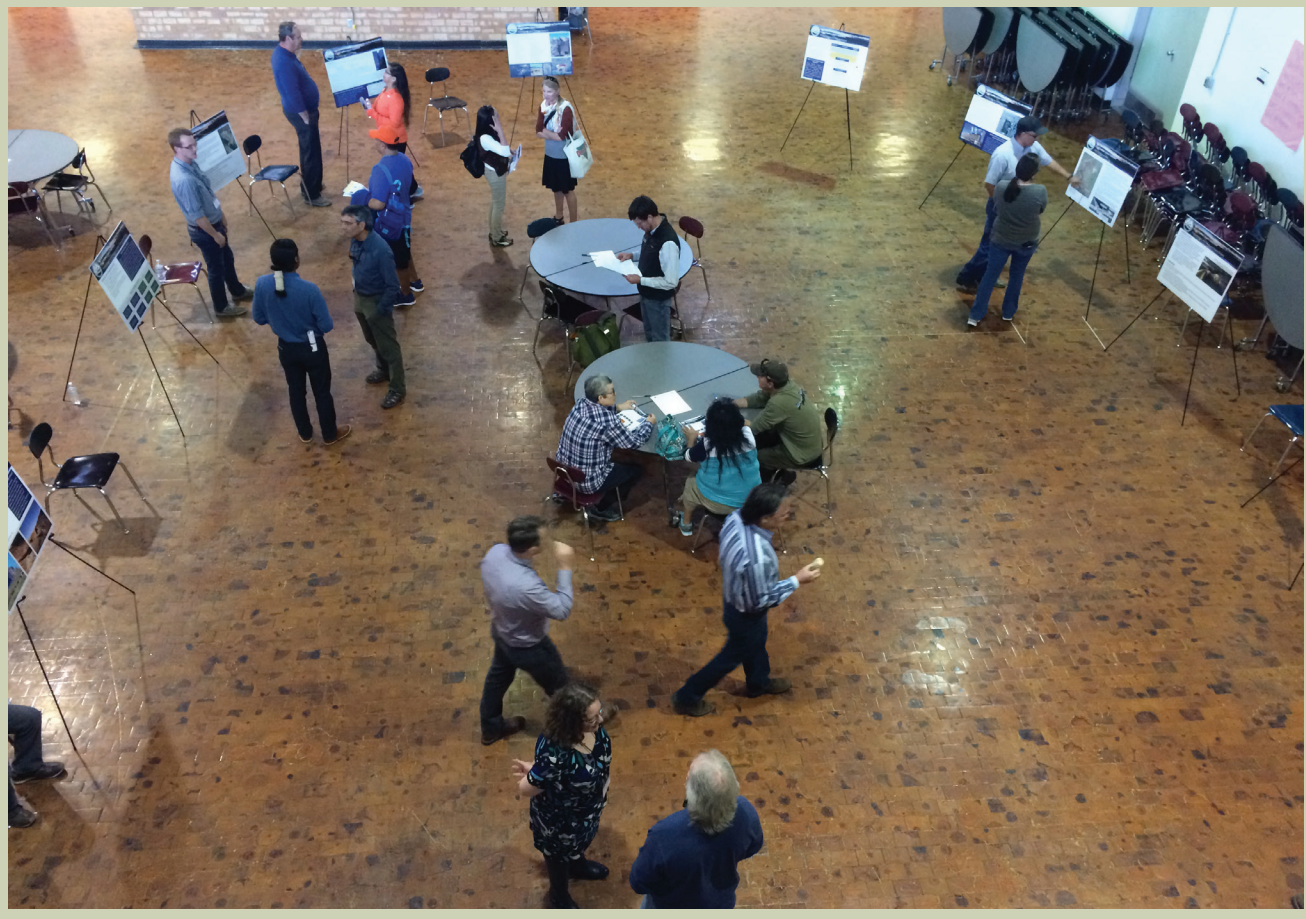
Public outreach in the Navajo Nation.

There are many ways of communicating with people who are visiting protected areas or are looking at a distance, from traditional techniques to the most innovative social media platforms. And there are many different objectives of communication, such as education and knowledge transfer and provision