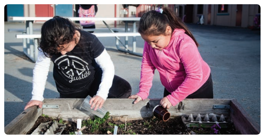
Live Oak Unified School District After School Program, Planting Activity

Parents/Families: The majority of children in the US do not eat the daily recommended 2 1/2-61/2 cups of fresh fruits and vegetables or 2-3 ounces of whole grains. Many children's diets include too many "empty calories" and high sodium levels. Often this is because families cannot afford to feed their children nutritious foods: the Federal Interagency Forum on Child and Family Statistics states that twenty-two percent of children lived in food-insecure households in 2010. FTS programs can help support families that are unable to consistently provide nutritious meals to their children due to family hardships. 17, 18, 19, 20, 21