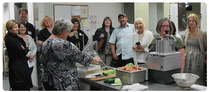
Centerpiece for a Healthy School Environment (CHSE) Statewide Food Service Director Training co-sponsored by CCSFA, June 2012

Post-training surveys speak to the effectiveness of the effort, as more than 40% of Food Service Directors participating in the 2011-2012 CHSE trainings purchased more fresh fruits and vegetables than prior to the trainings. 66 "The training was a great source of networking; I was able to secure three salad bars for my schools to enable us to serve fresh fruits and vegetables everyday. It also gave ideas for working with local farmers where we now procure organic fruits and vegetables for our salad bars!" noted one survey respondent. As a result of the 2011-2012 trainings, 48% of respondents have also increased their promotional efforts, and children taking part in school meal programs are eating nearly 60% more fresh vegetables and 65% more fresh fruit.<sup>67</sup>