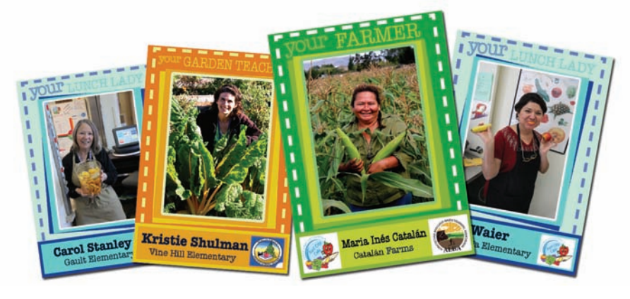
Central Coast School Food Alliance Farmer to Food Service Marketing Cards

Just south of Santa Cruz, in Monterey County, stakeholders—including the Second Harvest Food Bank, Health Department, and non-profit partners—are meeting to determine how to undertake a similar program partnering with county districts. These efforts can help defray the costs of food served in school meals, especially the costs of locally grown fresh fruits and vegetables, and encourage stronger regional relationships and partnerships.