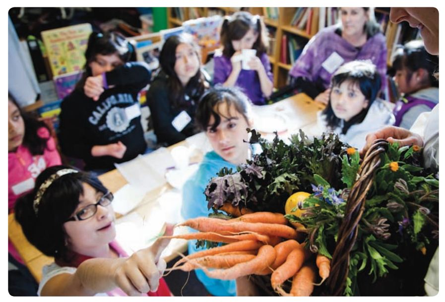
Live Oak Unified School District After School Program, Healthy Food and Family Activity

ALBA Organics purchases produce from both regional and ALBA farmers, then distributes these products (at competitive prices) to wholesale and retail buyers, as well as certain food service sectors, including schools, colleges, universities, and health care facilities, as well as corporate cafeterias such as those on the Google campus. 61