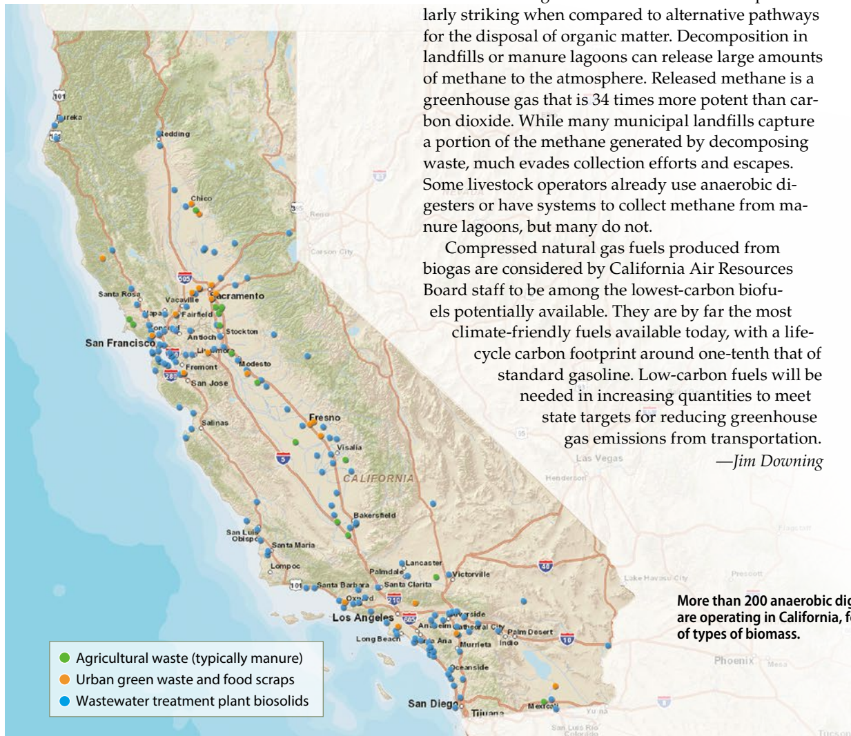
More than 200 anaerobic digestion facilities are operating in California, fed by a variety of types of biomass.