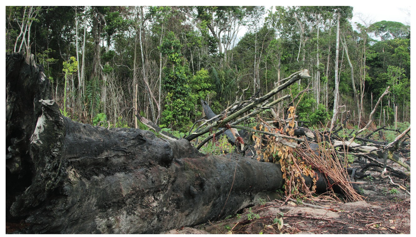
A Burned Amazon rainforest, to expand agriculture or cattle pasture, just outside the Parque Nacional de Anavilhanas, Brazil.

degraded vegetation. In the western US, climate change reduced post-fire regeneration of ponderosa pine and Douglas-fir by half from 1979 to 2015 (Davis et al. 2019). In Table Mountain National Park, South Africa, the heat and aridity of climate change and legacy effects of invasive alien species reduced post-fire plant species richness 12% in globally unique fynbos vegetation from 1966 to 2010 (Slingsby et al. 2017).