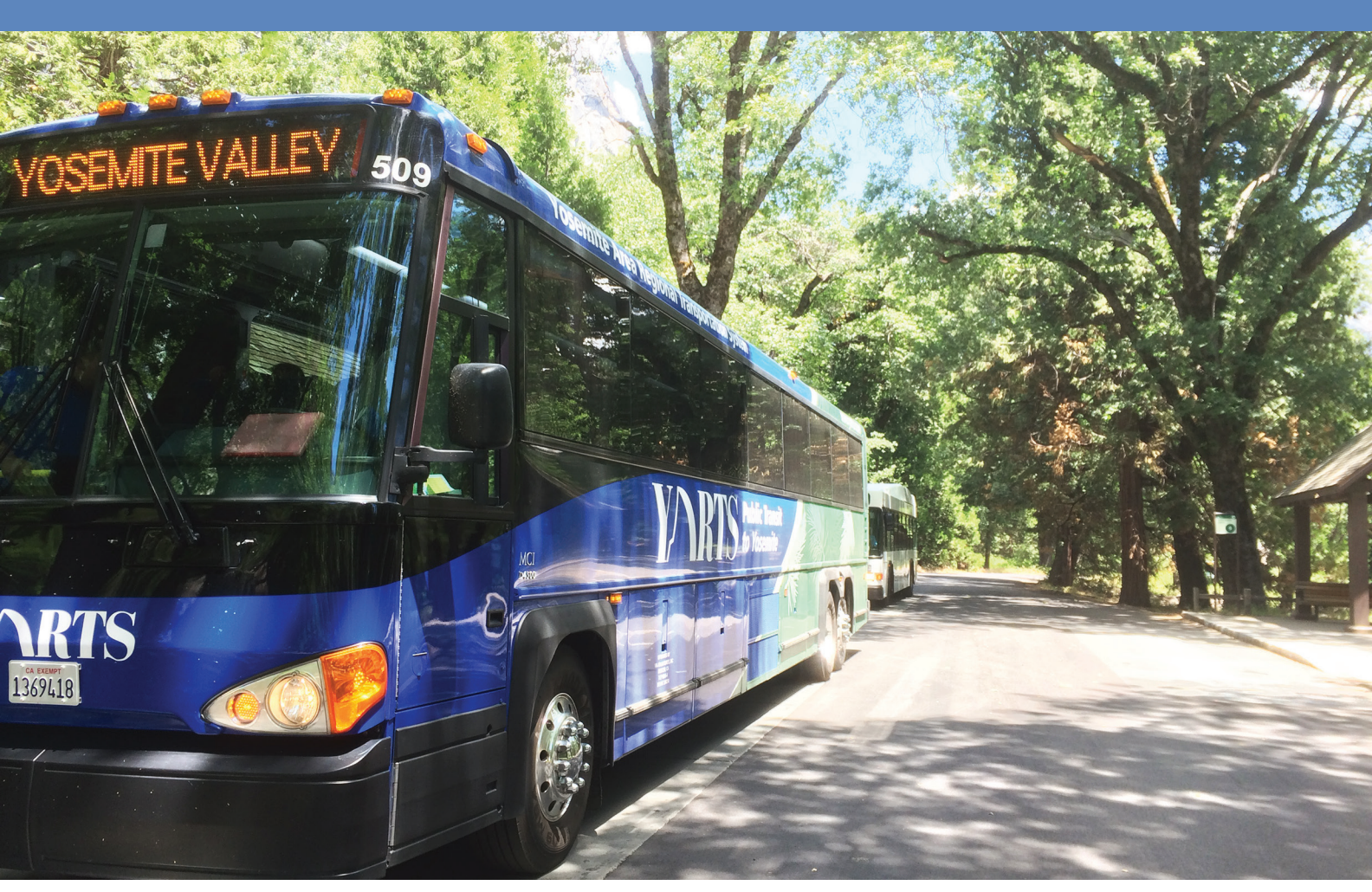
▲ YARTS public transit, Yosemite National Park, California.

(BART) station for a train to Richmond, California. Then I board an Amtrak train to Merced, California. A Yosemite Area Regional Transportation System (YARTS) bus meets the train at the station and runs to Yosemite Valley.