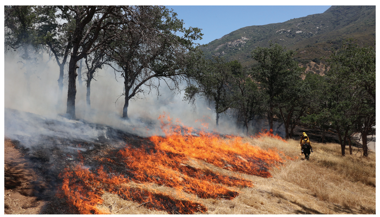
▲ Prescribed burn, Sequoia National Park, California.

Wildfires have tragically killed many people, so saving human life remains the first goal of US national fire policy (WFLC 2014). In the US, 25 million more people have moved into and 13 million more houses were built in fire-prone areas from 1990 to 2010 (Radeloff et al. 2018). Deaths and losses of homes are a function of the number of people who live in fire-prone areas. So, avoiding building new homes in fire-prone areas offers a common-sense precaution.