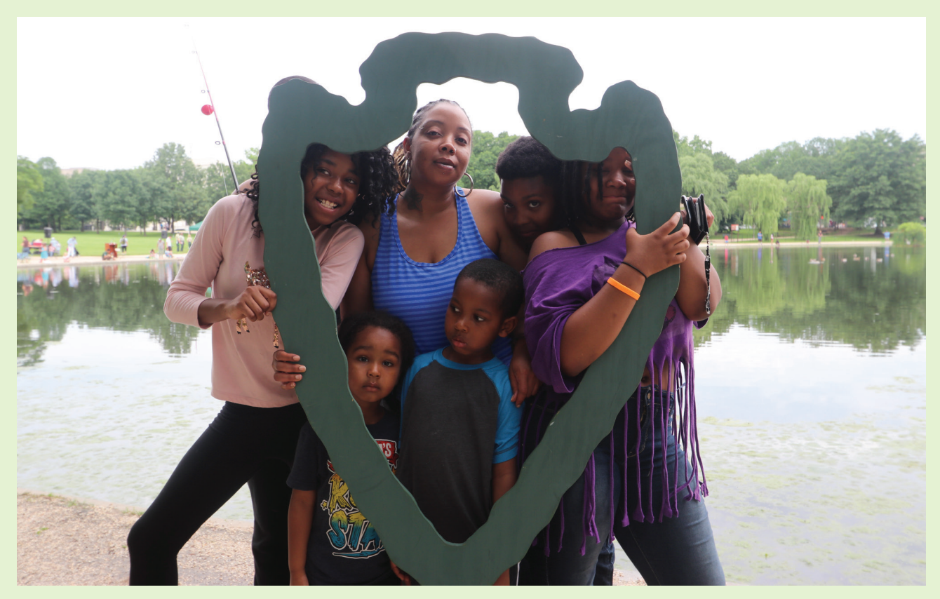
Family at Urban Kids Fishing Derby on National Mall

pandemic we have seen that when there is less traffic, the air is cleaner, the night skies are clearer, and you can see the stars more vividly. Waterways lose their turbidity and become crystal clear. You can see the fish. All that is becoming more visible in the natural world is beginning to stir in many of us a new consciousness that there are a few things we need to change in order to build back a stronger, healthier, and more sustainable world. And perhaps this pandemic has demonstrated that, through sustained cooperation and commitment to advancing and protecting the role of parks as a health resource, we can provide these precious resources for generations to come.