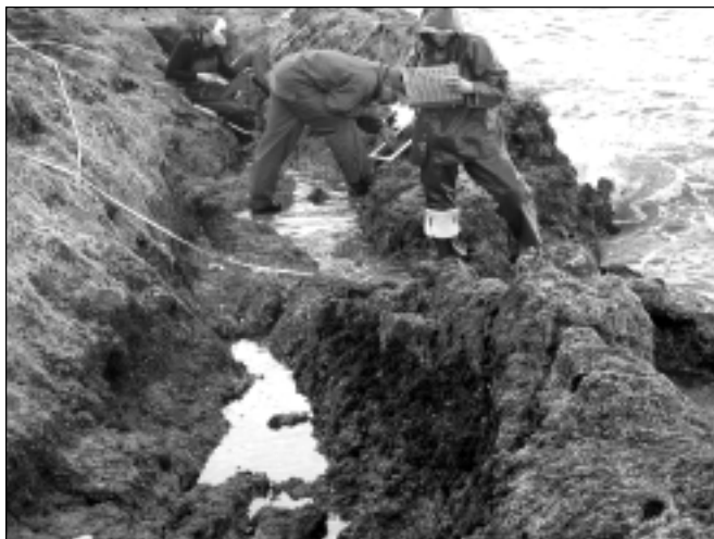
PISCO researchers "at the office" — UCSC marine biologist Pete Raimondi in the center.

A final major breakthrough has been the increased focus on oceanographic input, such as wave and current motion, wave impact, and stratification of water masses. Newly developed instruments now make it possible for scientists to model the nearshore environment in ways unavailable five years ago — and to explore the biological significance of the oceanographic information they collect. PISCO's use of ADCPs (Acoustic Doppler Current Profilers) in the nearshore environment provides a perfect example. At several sites along the coast, divers mounted ADCPs on the sea floor, temporarily and on rocks, in 20 feet of water. The sensors detect water motion at one-meter intervals up through the water column. This information allowed researchers to develop an accurate picture of how the movement of currents affects the delivery of the larvae that replenish intertidal and nearshore populations. (Certain species of intertidal animals drift around on the ocean currents during the larval stages of their lives, then later come ashore and attach to the rocks.) Now, for the first time, scientists are beginning to understand the factors involved in replenishing fish, invertebrates, and kelp populations. Future marine reserves will be designed to promote the delivery of larvae so the young animals will thrive and grow, creating a healthy ecosystem and fisheries.