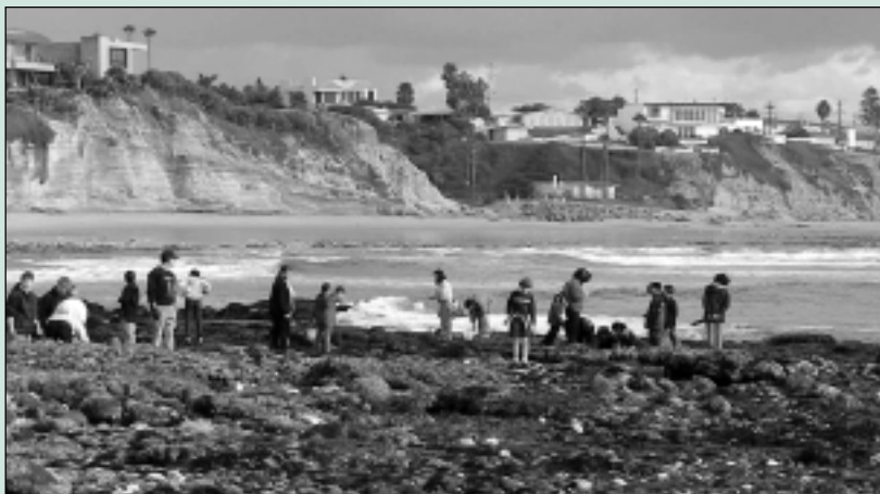
Some well-meaning intertidal zone tramplingers at Scripps Coastal Reserve near UC San Diego.