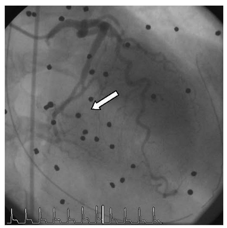
Figure 2. Left coronary angiogram (right anterior oblique cranial view), demonstrating an abrupt cutoff of the second obtuse marginal vessel secondary to a shotgun pellet.

myocardium and the pericardial space could not be definitively determined. There was a very small pericardial effusion without evidence of tamponade or wall motion abnormalities. The patient was taken for an emergent coronary angiography, which demonstrated occlusion of the second obtuse marginal vessel secondary to a shotgun pellet without other evidence of significant coronary atherosclerotic disease (Figure 2). Left ventricular function was good, with an ejection fraction of 55%.