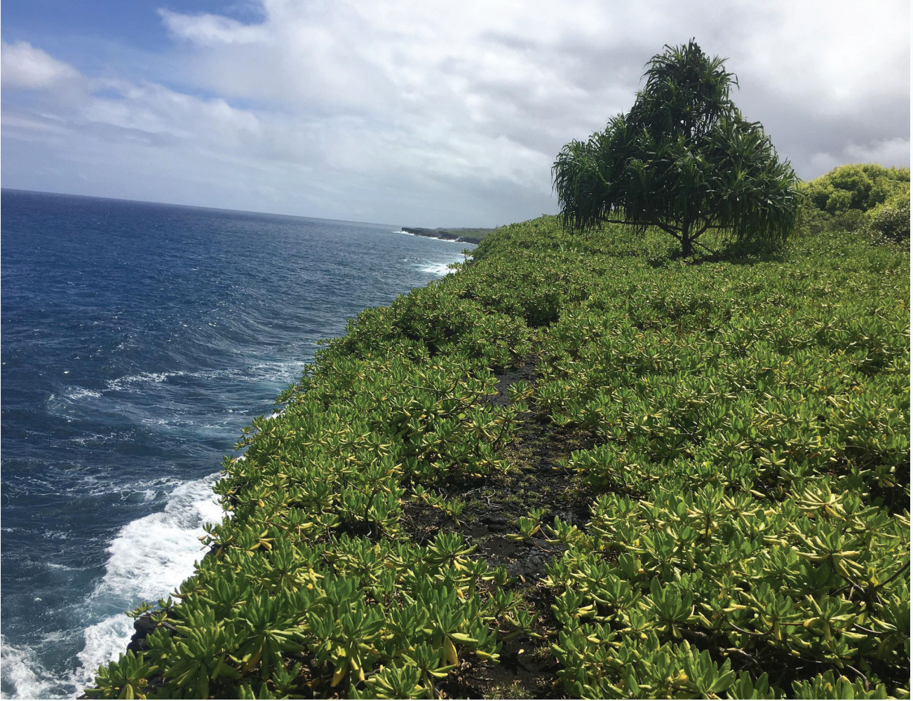
▲ FIGURE 4. Single mature hala on immediate Kalapana coastal edge, June 2020. GINA MCGUIRE