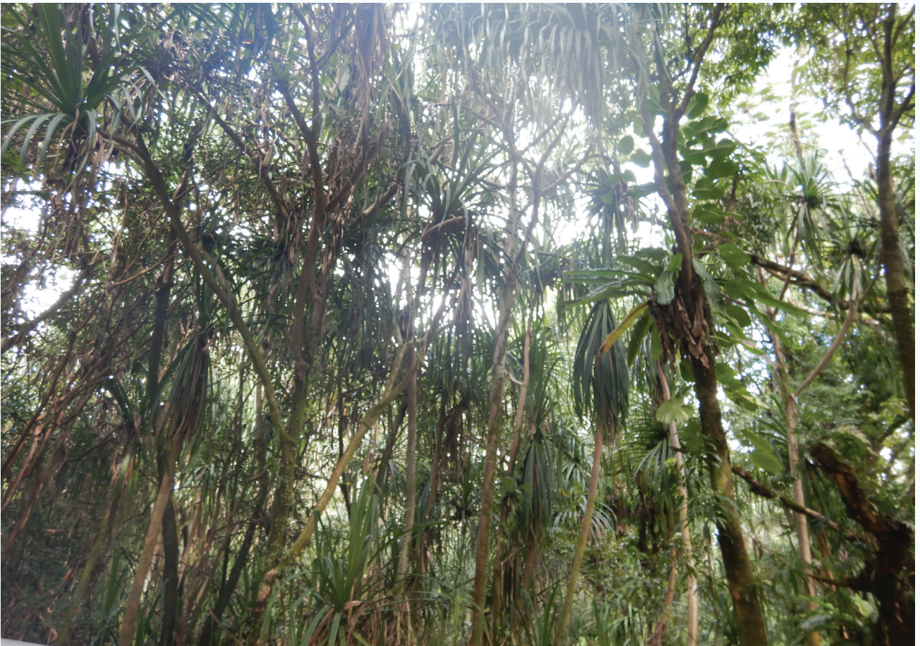
▲▲ FIGURE 1. Hala “stand” (5–10 mature trees), January 2022. GINA MCGUIRE