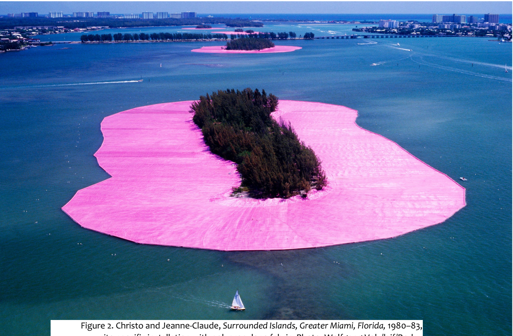
Figure 2. Christo and Jeanne-Claude, Surrounded Islands , Greater Miami, Florida, 1980–83, site-specific installation with polypropylene fabric.

couple was able to raise funds from selling sketches and drawings of the proposed plans for Surrounded Islands . Christo and Jeanne-Claude obtained permits from at least eight different agencies and collaborated with a team of marine biologists, ornithologists, mammal experts, marine engineers, consulting engineers, and building contractors. Safeguarding the integrity of the landscape and seascape was an essential priority for this project and unfolded in its own theatre of ecocritical performance. Florida, as the northern tip of the Caribbean, is part of an ecological zone drastically affected by human activity, as Elizabeth DeLoughrey notes: “There is probably no other region in the world that has been more radically altered in terms of flora and fauna than the Caribbean.” 1 The title, Surrounded Islands , accentuates the spatial and temporal conditions of islands as spaces “surrounded” by water and sometimes other islands (see Figure 1 ). This overemphasis is a response to the poetics of archipelagoes and their material and cultural adaptations through island movements.