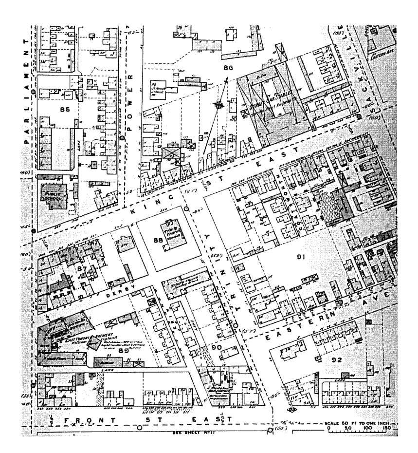
Early fire insurance maps included many details about the design of streets and the buildings along them.

and local traffic, landscaped pedestrian medians and generous provisions for on-street parking, the boulevard neatly reconciles what has been regarded as completely incompatible — high volumes of traffic and pedestrian-friendly urban street edges.