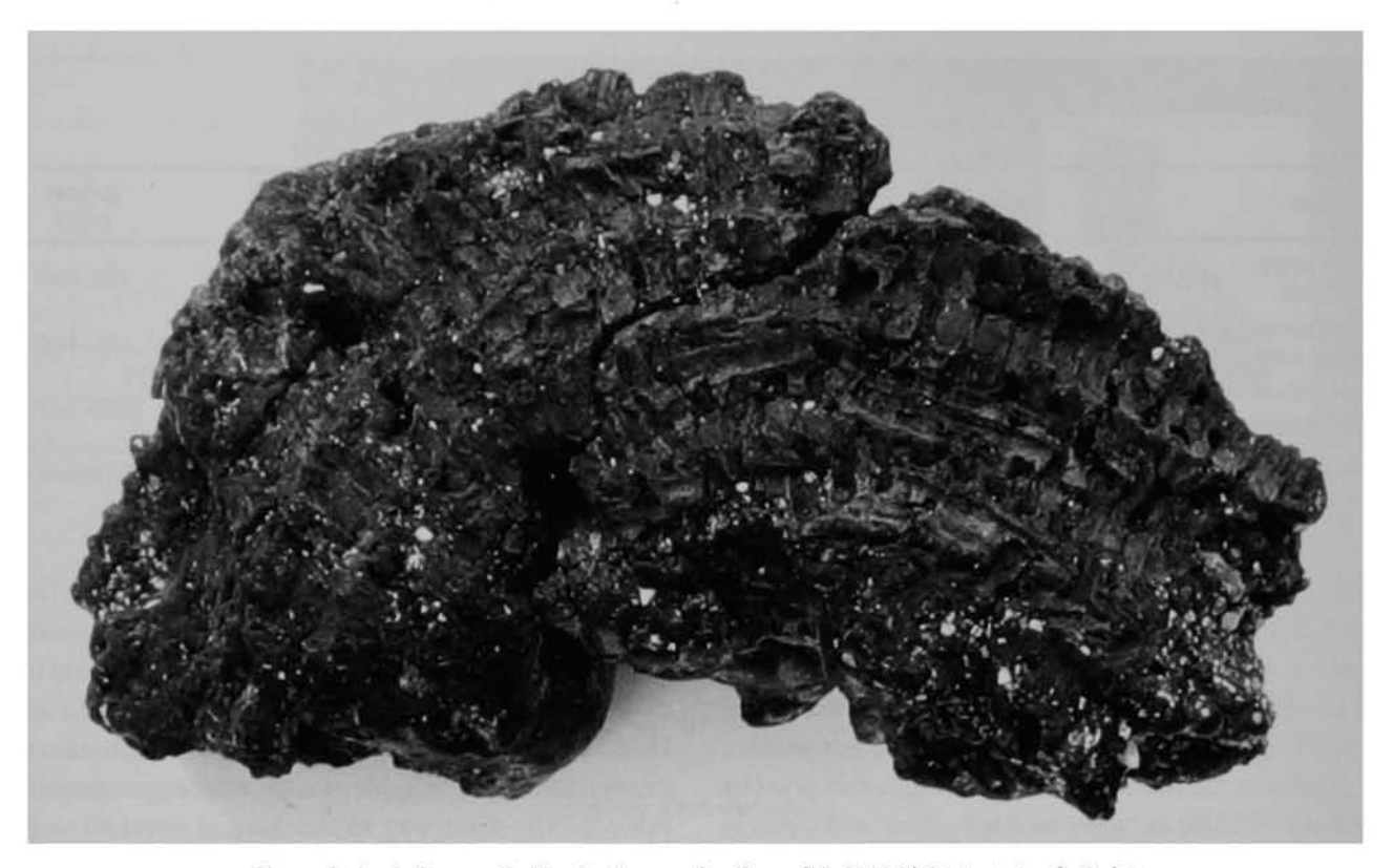
Figure 2. Asphaltum coiled basket impression from CA-SMI-396.

basket were also found near the tarring pebble feature in this eastern site area. Unfortunately, these impressions were too fragile and fragmentary to recover for analysis.