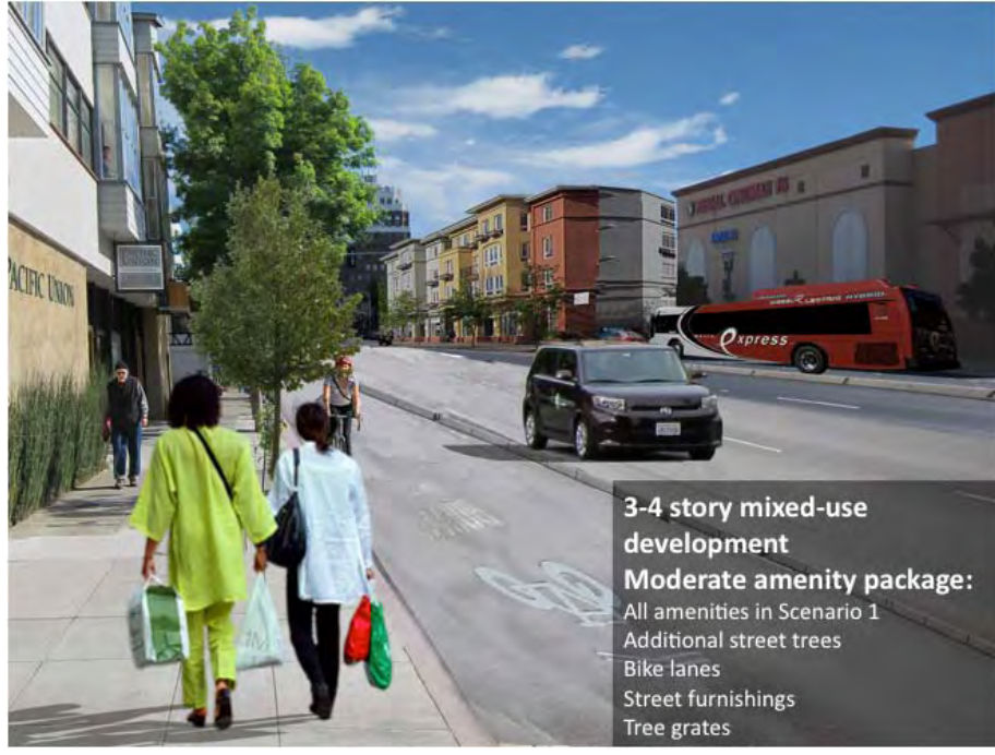
Figure 5. Miner Ave - Scenario 2