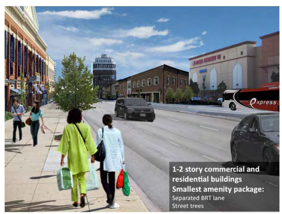
Figure 4. Miner Ave - Scenario 1