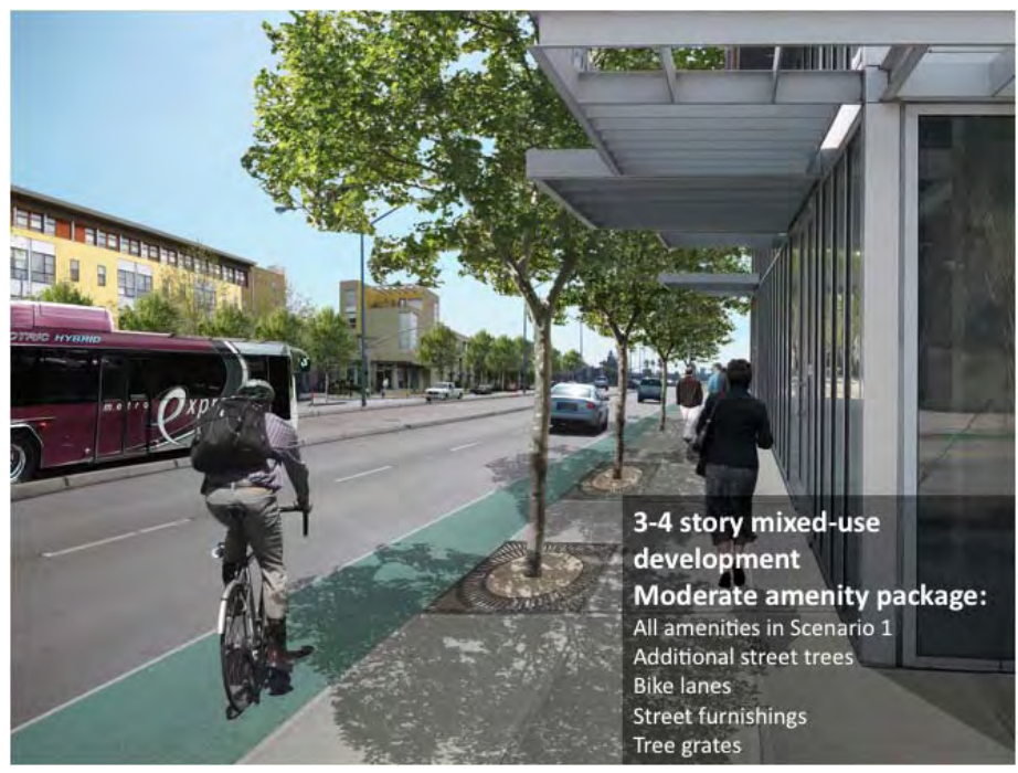
Figure 10. Pacfic Ave - Scenario 2