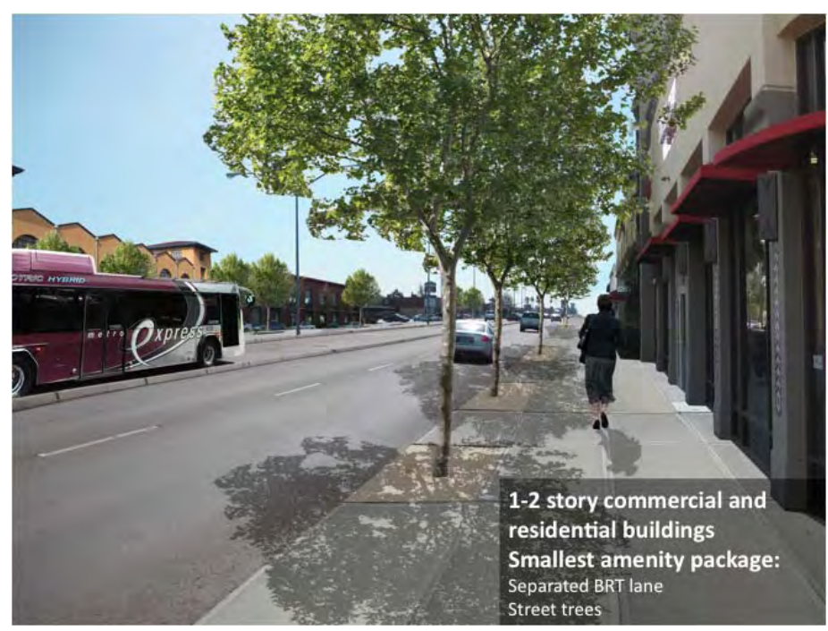
Figure 9. Pacfic Ave - Scenario 1