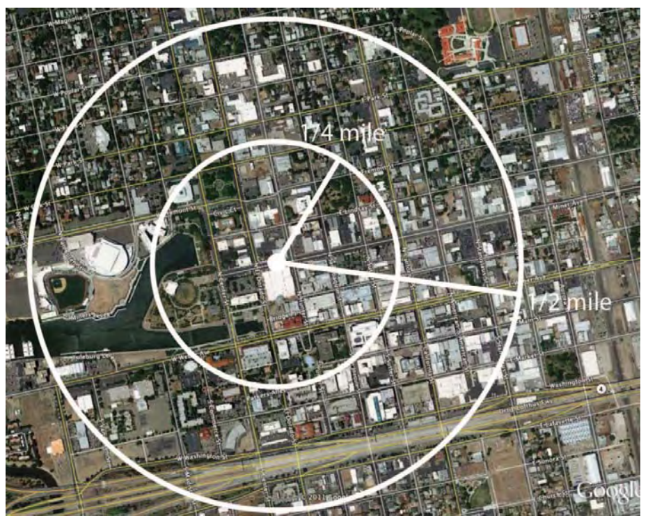
Figure 2. Miner Avenue at El Dorado Street - Walk Sheds

number is primarily composed of jobs per acre, not residents, given the large number of employment centers downtown). The three photo simulations below (Figures 4, 5, and 6) depict the possible density configurations that could occur with various BRT investments.