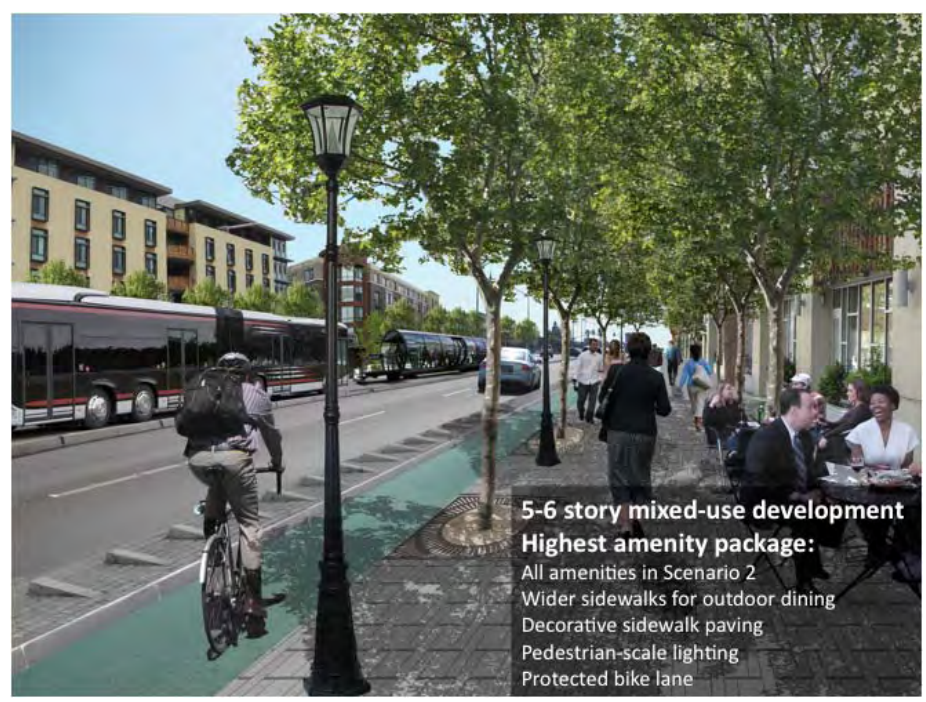
Figure 11. Pacific Ave - Scenario 3