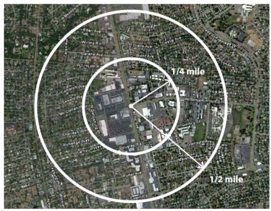
Figure 7. Pacific Ave - Walk Sheds