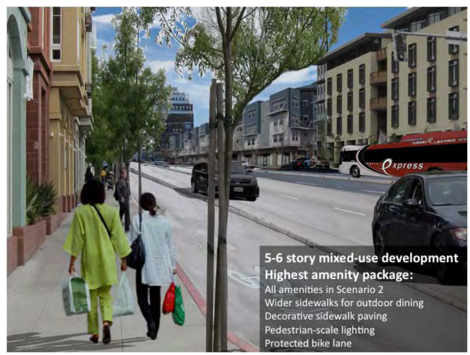
Figure 6. Miner Ave - Scenario 3