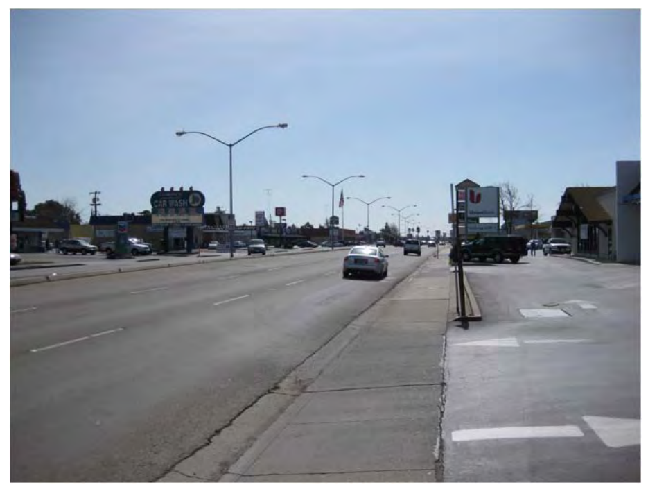
Figure 8. Pacific Ave - Existing Conditions