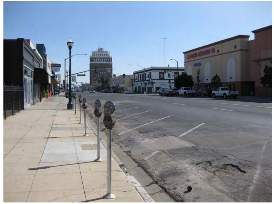
Figure 3. Miner Ave - Existing Conditions