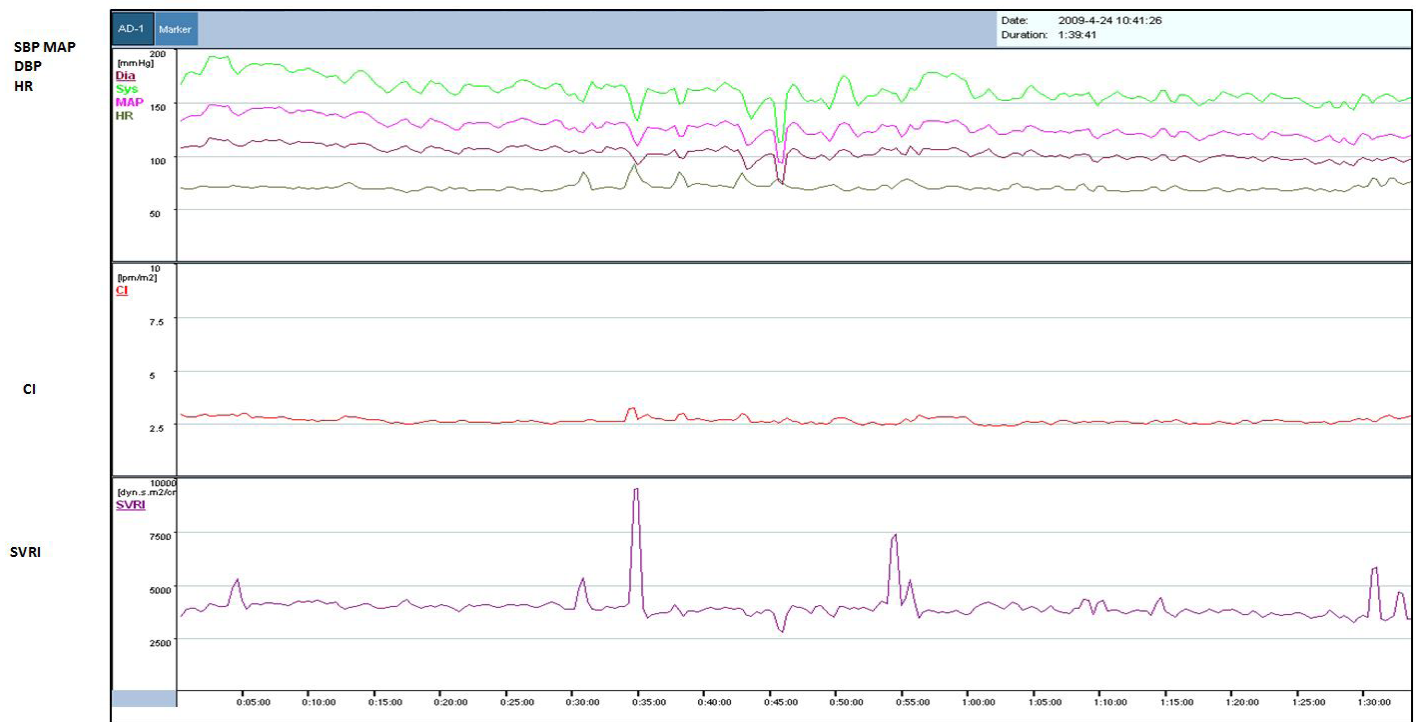
SBP, systolic blood pressure; MAP, mean arterial pressure; DBP, diastolic blood pressure; HR, heart rate; CI, cardiac index; SVRI, systemic vascular resistance index