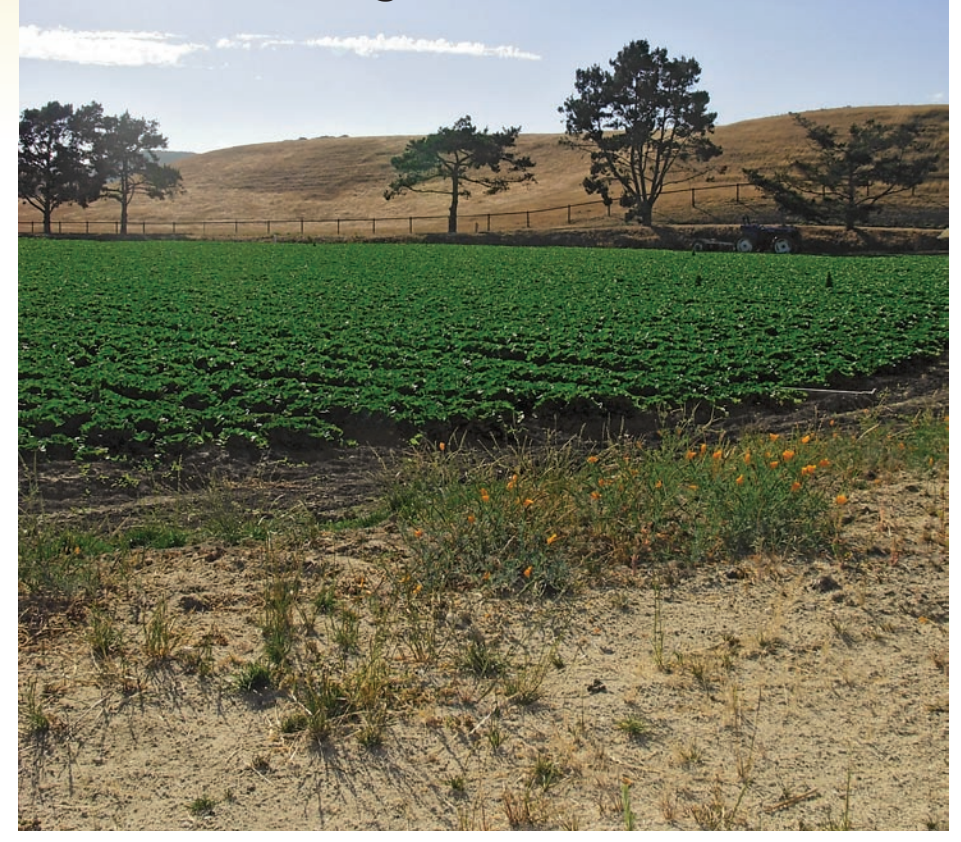
Growers of leafy greens and vegetables must balance the need to improve water quality and wildlife habitat in and around farms, with concerns about food safety.

Simultaneously, growers on the Central Coast face increasing demands to