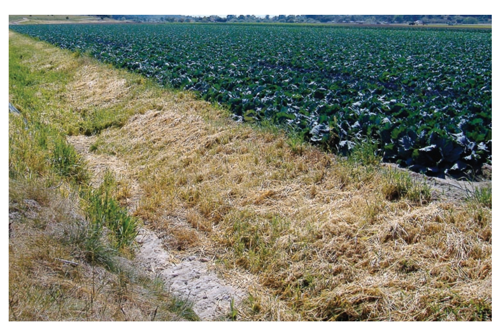
Border strips around fields, shown on a Central Coast farm, help improve water quality by filtering runoff into and off of farmland. However, such strips may also create habitat for small animals, which may be perceived as a food safety risk.

This study was funded in part by the Community Foundation for Monterey County (#20040679), the California State Water Resources Control Board (#04-326-553-0 and 05-122-553-1) and USDA Natural Resources Conservation Service (#65-9104-7-611).