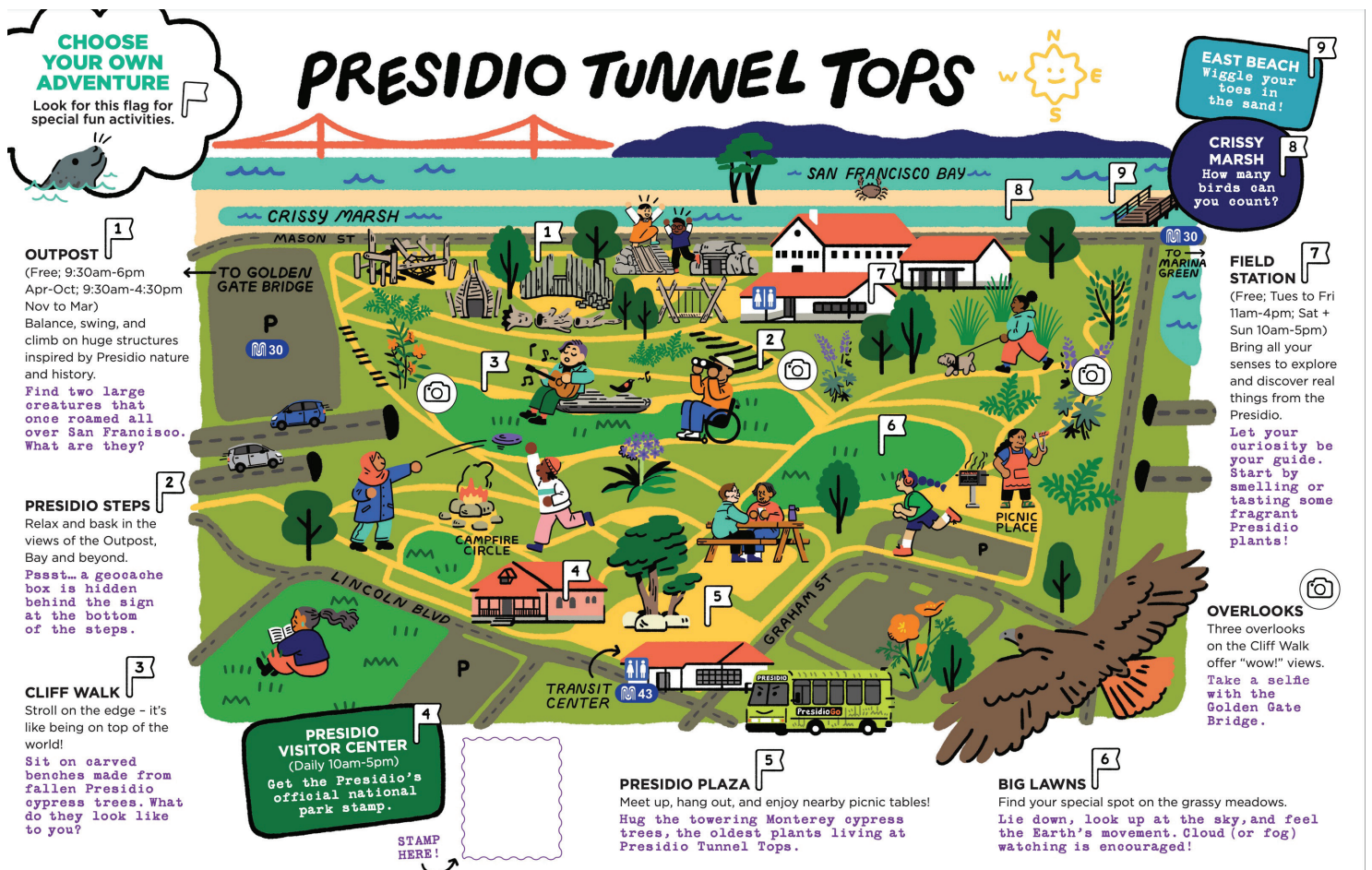
▼ Tunnel Tops visitor guide map