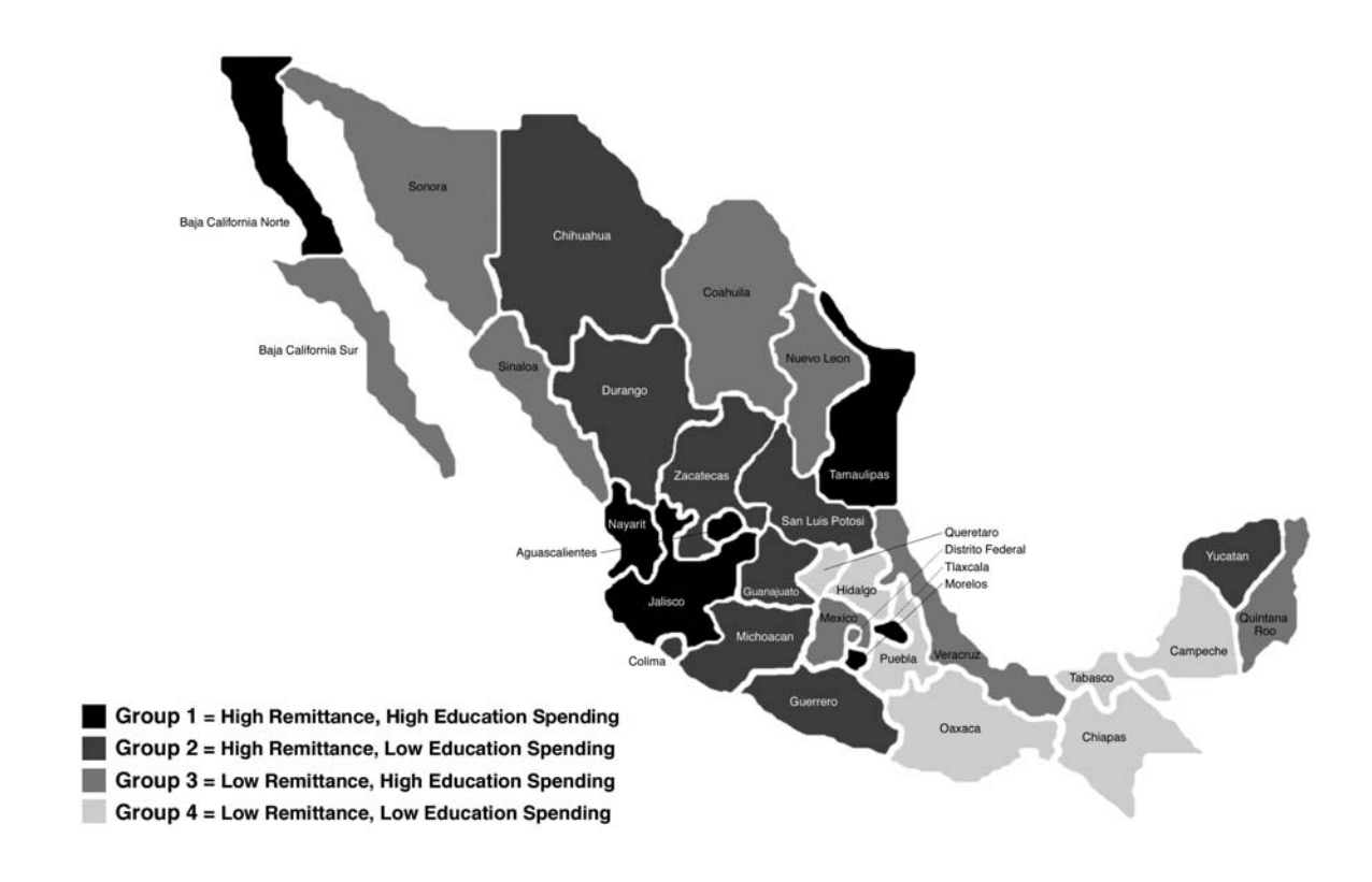
Figure 1: Remittance Income and Education Spending Characteristics by State

recession followed by a strong recovery that affected different sector of the economy quite differently. In the same vein, we account for state-fixed effects. As we can see in Figure 1, the characteristics of the average household vary a great deal by state. For instance, on average, households in south-eastern Mexico have lower remittance income and lower education expenditures, while the average household in states nearer to Mexico City have higher remittances and higher education spending. Additionally, households in the northern region of Mexico have higher remittance income, on average, than households in the southern regions of the country.