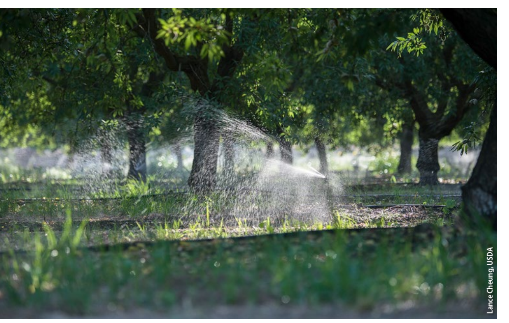
Irrigation in an almond orchard. Almonds are the leading crop in Madera County, with the 2016 harvest valued at $593 million.

As far as support from the state — I think they've been really good. You go and you have questions — and maybe they don't have everything in place, and there aren't defined responses yet, but they've tried very hard to lead me in the right direction or provide me with as much information as they can. The biggest hurdle for everyone is that SGMA implementation is an ongoing thing — it's been building, with the rules and guidance coming out slowly but surely.