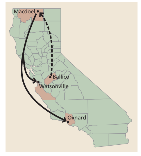
Fig. 1. Nursery production evaluations were conducted at a low-elevation site at Ballico. Harvested runner plants were then transported to Macdoel for use in the high-elevation experiment. Fruit evaluations were conducted on the coast at Watsonville and Oxnard.

ducted in strawberry nursery and fruit production systems to evaluate the effects of alternative fumigants on disease, nematode and weed control. We monitored the movement of plants through the system, allowing inferences to be made about the cumulative effects of fumigation. In addition, we gathered and evaluated information on the economics of production for each treatment. To our knowledge iodomethane has never before been evaluated in California strawberry nurseries. More detailed methods and results are published elsewhere (Kabir et al. 2005).