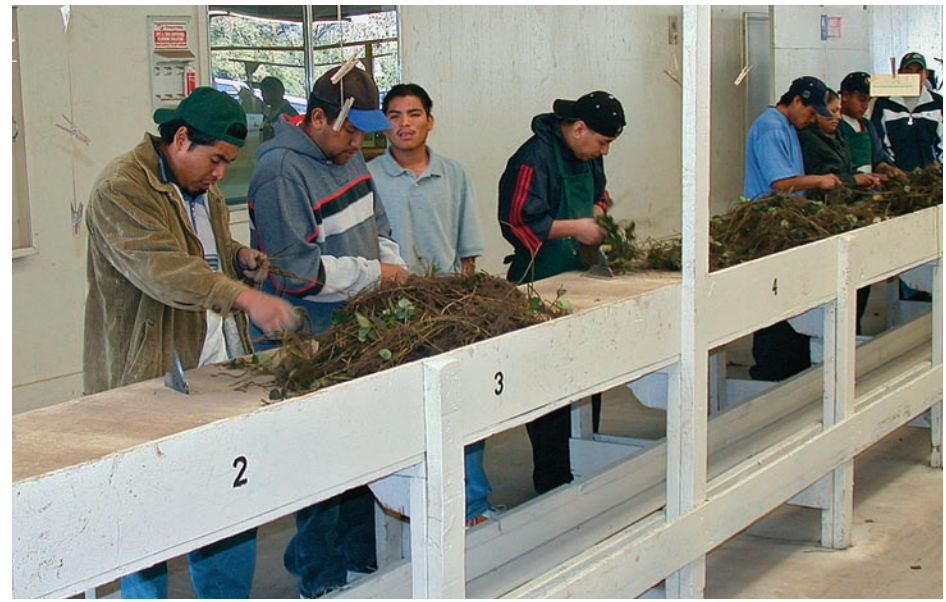
At Lassen Canyon's trim shed in Redding, workers sort strawberry plants harvested the previous day from high-elevation nursery fields. The workers separate healthy, marketable plants, trim them and then pack them for shipment to fruiting fields on the California coast.

At Macdoel, the treatments evaluated were: (1) equal amounts of iodomethane and chloropicrin at 350 pounds per acre; (2) methyl bromide plus chloropicrin at 400 pounds per acre (57% MB + 43% CP); (3) chloropi-