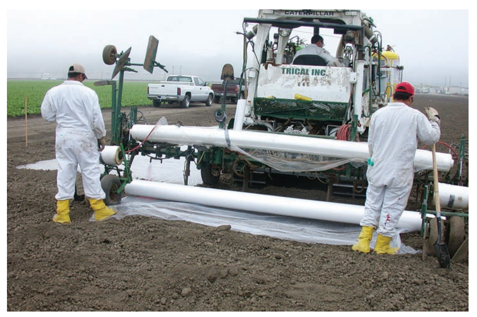
The fumigant methyl bromide — which is being phased out due to its impacts on the ozone layer — was used as a standard for the control of soilborne pests and diseases in all the nurseries and fruiting fields in this study. Above , methyl bromide is applied in a fruiting field near Watsonville.

University of California researchers Larson and Shaw (2000) evaluated alternative fumigant treatments in low- and high-elevation nurseries to measure the effects on runner-plant production. However, until we began this project, no comprehensive studies had been con-