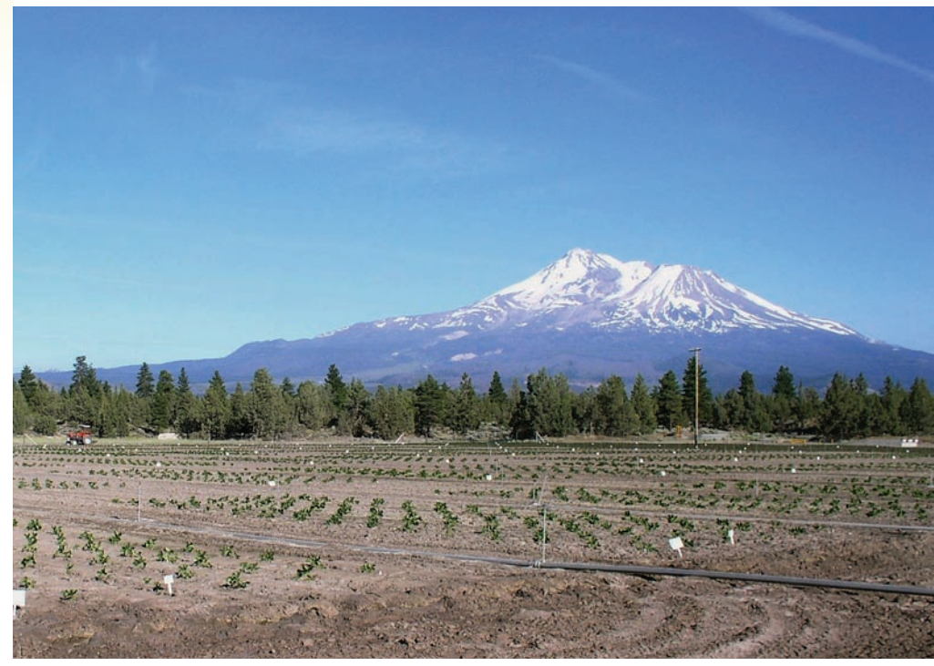
California strawberry runner plants are propagated in high-elevation nurseries such as this one near Macdoel, north of Mt. Shasta. The harvested runner plants are transported to fruiting fields in California or exported to other states or countries.

Methyl bromide (MB) is a fumigant that is applied to the soil before planting to provide season-long control of soilborne pathogens, insects, nematodes and weeds. Several vegetable, fruit and perennial crops rely on methyl bromide for pest control (USDA ERS 2000). In the United States, tomatoes, strawberries and peppers account for most of the methyl bromide used in soil fumigation (30%, 19% and 14%, respectively) (Carpenter et al. 2000). Other crops that use methyl bromide include almonds,