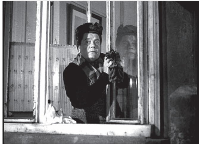
Above: The Third Man . The urban window facilitating simultaneous occupancy of public (exterior) and private (interior) space.

Lesson: Street-wall windows bridge immediately adjacent private and public spaces and enable people to occupy both realms simultaneously, a subtle and sometimes precarious condition of urban life.