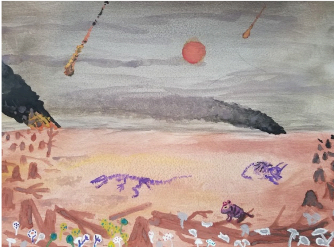
Figure 2: One of Dr. Casadevall's watercolor paintings. Reprinted with permission.

living C by plugging directly into plant roots.” The exchange is mutual—AMF also pick up essential nutrients like N and P from the surrounding soil and transport them back to plants. Firestone’s recent genomics research focuses on what she calls “helper bacteria,” which associate with AMF. Though Firestone stressed that “this is a story that’s still unraveling,” she believes helper bacteria could work to decompose organic N into ammonia—a bioavailable form that AMF can help transport into plants. By ^{13}\text{C} -labeling AMF hyphae and tracing which bacteria around the hyphae are picking up ^{13}\text{C} , Firestone and her group are working to “establish a direct link between hyphae supplying C and bacteria living around them that are consuming it.”