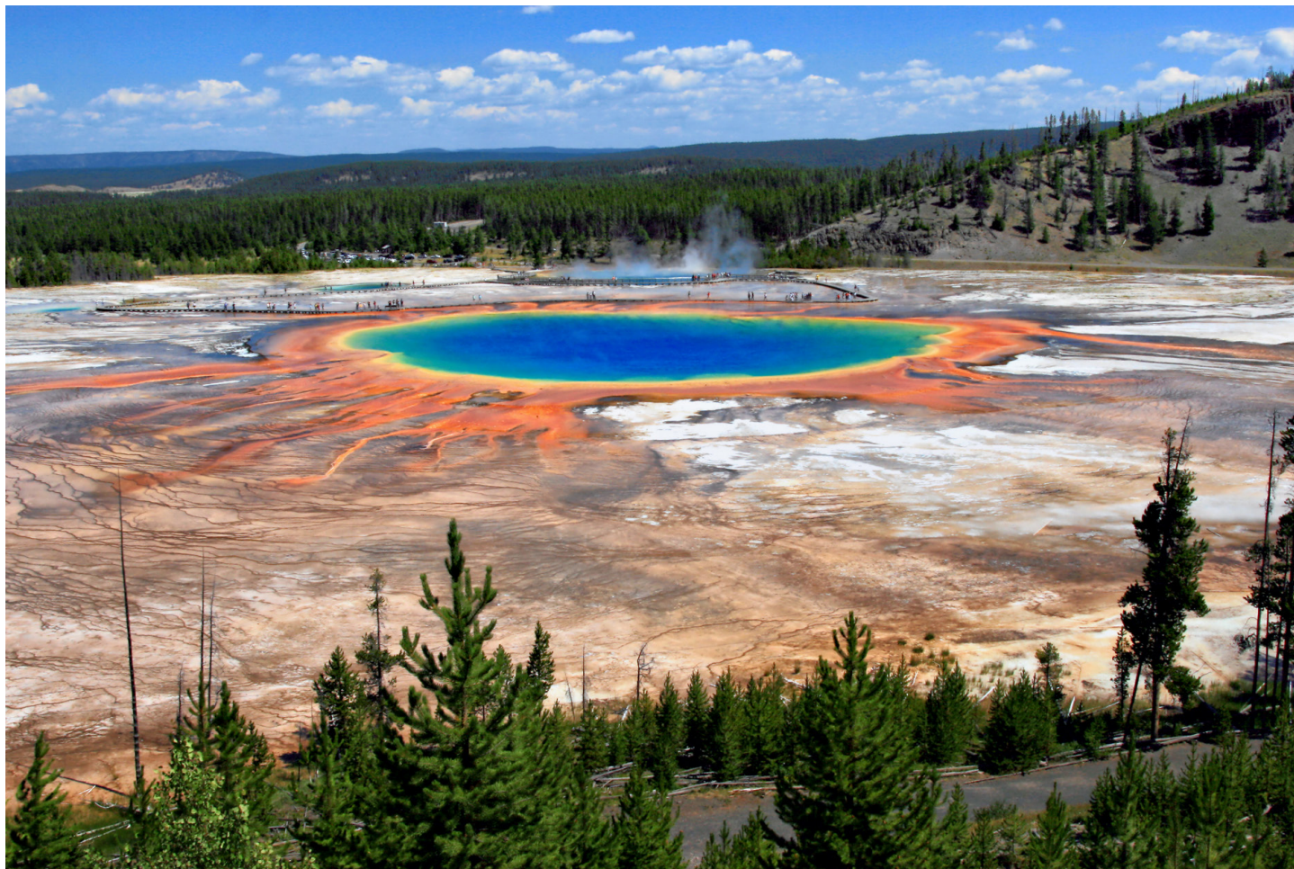
Figure 1: Grand Prismatic Spring, Yellowstone National Park. 7 Microbial mats give the spring its vivid colors.