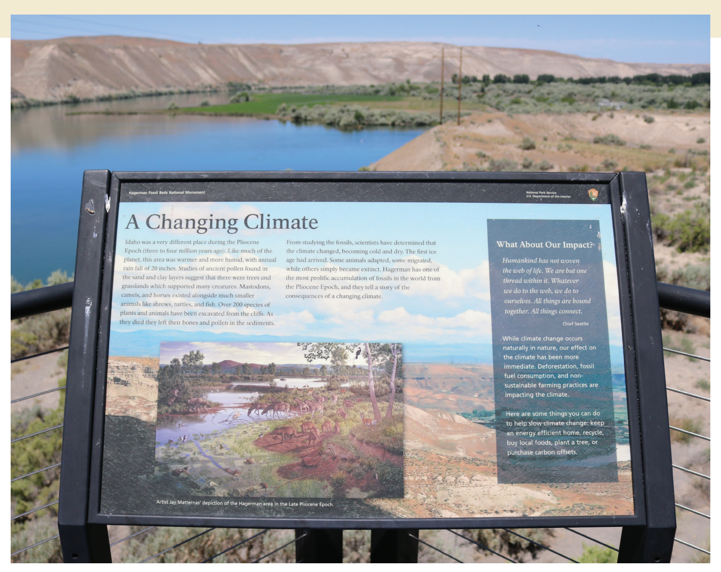
A wayside exhibit at Hagerman Fossil Beds National Monument puts climate change into geological-time perspective—and offers some suggestions for actions people can take today. The National Park Service has begun to speak frankly about the threats climate change poses to national parks and park values, but many difficult conversations lie ahead.