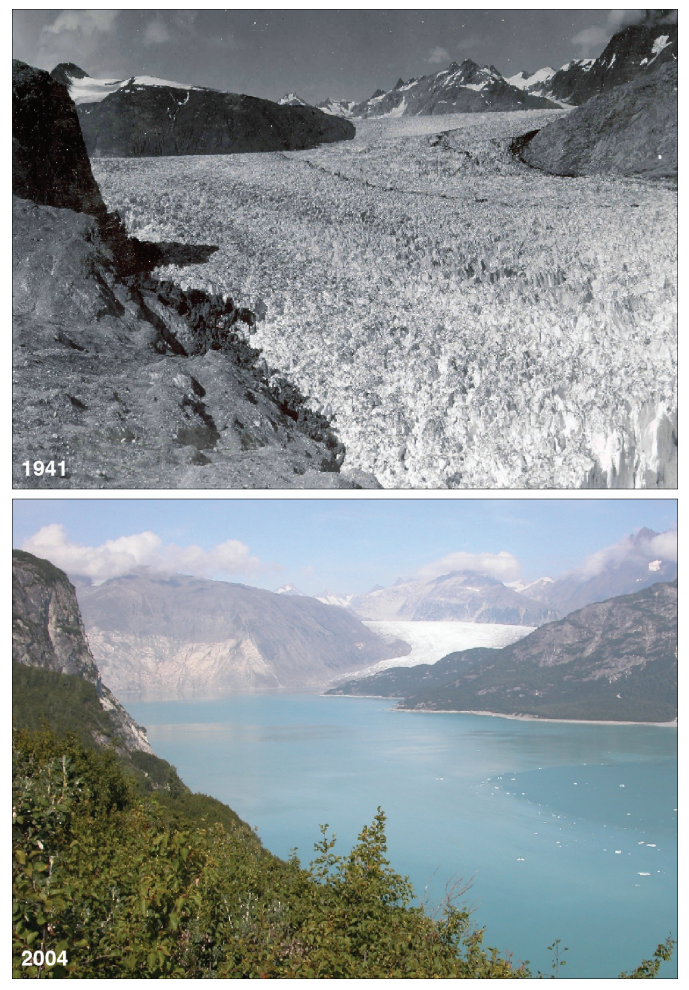
FIGURE 2. Muir Glacier, Glacier Bay NP on August 13, 1941 (photo William O. Field, courtesy of the National Park Service, National Snow and Ice Data Center, and US Geological Survey) and on August 31, 2004 (photo Bruce F. Molina, courtesy US Geological Survey). Photos aligned by P. Gonzalez. From 1948 to 2000, climate change melted 640 m in depth from Muir Glacier at its lowest extent (Larsen et al. 2007; Marzeion et al. 2014).

Across the southwestern US, the increased heat and aridity of human-caused climate change account for half the magnitude of a regional drought from 2000 to the present that has been the most severe drought since the 1500s, reducing soil moisture to its lowest levels since that time (Williams et al. 2020). In California, the most severe drought in a century of weather station measurements occurred from 2012 to 2016, caused by the hottest annual average temperature in the period 1896-2014 and near-record low rainfall and snowfall (Diffenbaugh et al. 2015). The high temperatures of climate change accounted for one-tenth to one-fifth of the magnitude of the California drought (Williams et al. 2015). In the Colorado River Basin, the high temperatures of climate change have combined with low rainfall and snowfall to cause a drought from 2000 to the present that is the most severe since the start of weather station measurements in 1906 (Udall and Overpeck 2017; Xiao et al. 2018).