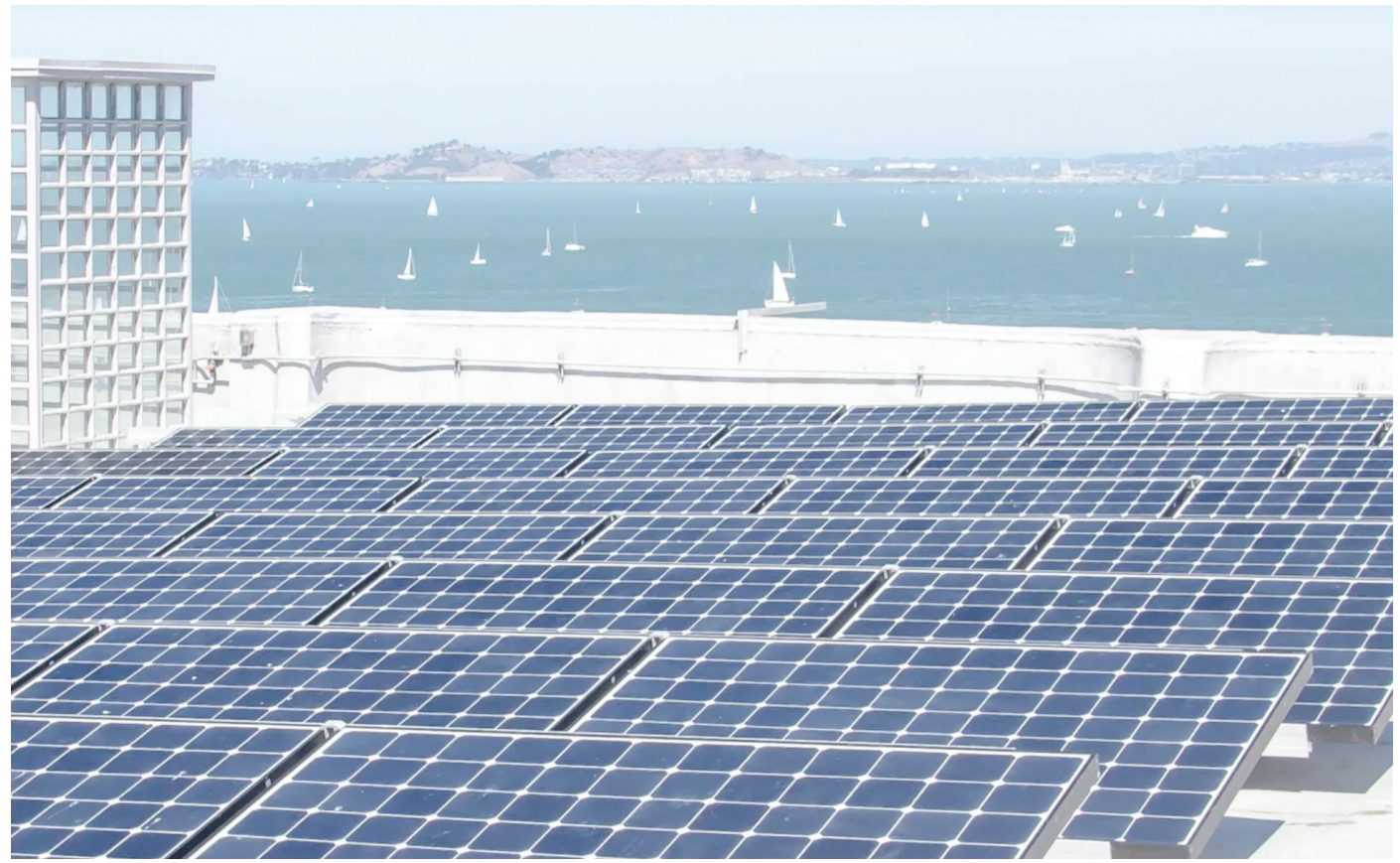
FIGURE 6. Solar energy array on Alcatraz Island in Golden Gate NRA that helped the park reduce carbon emissions 25% from 2010 to 2015 (NPS 2016).

Reducing CO<sub>2</sub> emissions can avert the most extreme temperature increases in national parks in the future. The IPCC emissions reduction scenario (RCP2.6), in which the world would meet the Paris Agreement goal, would lower projected heating in national parks by two-thirds by 2100, compared with the highest emissions scenario (RCP8.5) (Gonzalez et al. 2018). The reduced heating could produce substantial benefits on the ground. While the highest emissions scenario puts 16% of plant and animal species globally at risk of extinction, the risk drops to 5% under the emissions reduction scenario (Urban 2015). Similarly, global sea level could rise 84 cm (33 in.) under the highest