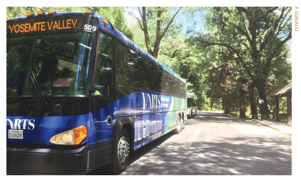
FIGURE 5. A Yosemite Area Regional Transportation System bus in Yosemite NP that helped the park reduce carbon emissions per visitor 10% from 2008 to 2011 (Villalba et al. 2013).

US national parks have implemented emissions reduction actions. Yosemite NP reduced greenhouse gas emissions per visitor 10% from 2008 to 2011 through energy conservation, energy-efficient lighting, solar energy, recycling, water conservation, and public transportation (Villalba et al. 2013). Greenhouse gas emissions inventories of 18 national parks showed that visitor cars produced 75% of park emissions (Steuer 2010). Yosemite NP helped to set up a regular bus route from the nearest Amtrak rail station to Yosemite Valley (Figure 5) and shuttle buses within the park that