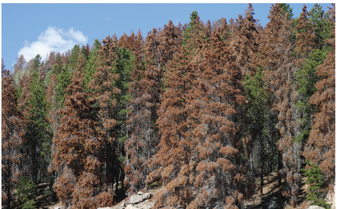
FIGURE 3. Dead lodgepole pines ( Pinus contorta ) in Rocky Mountain NP. Climate change doubled tree mortality across the western US, in a sample that included sites in the park, from 1955 to 2007 (van Mantgem et al. 2009).

Tree mortality. Across the western US, including sites in Kings Canyon, Lassen Volcanic, Mount Rainier, Rocky Mountain, Sequoia, and Yosemite National Parks, climate change doubled tree mortality from 1955 to 2007 (van Mantgem et al. 2009), due to drought, the most extensive bark beetle infestations in a century, and increased wildfire (Raffa et al. 2008; van Mantgem et al. 2009; Berner et al. 2017) (Figure 3). In Sequoia NP and across the Sierra Nevada, subsurface moisture exhaustion and soil drying due to climate change increased tree mortality during the California drought by one-quarter over the 1984-2015 average (Goulden and Bales 2019). In plots in Sequoia NP, nearly one-quarter of trees died during the California drought, with mortality rates of ponderosa pine (Pinus ponderosa) and sugar pine (Pinus lambertiana) increasing up to seven times the mortality of the non-drought period of 2004-2007 (Stephenson et al. 2019). In Yellowstone NP and