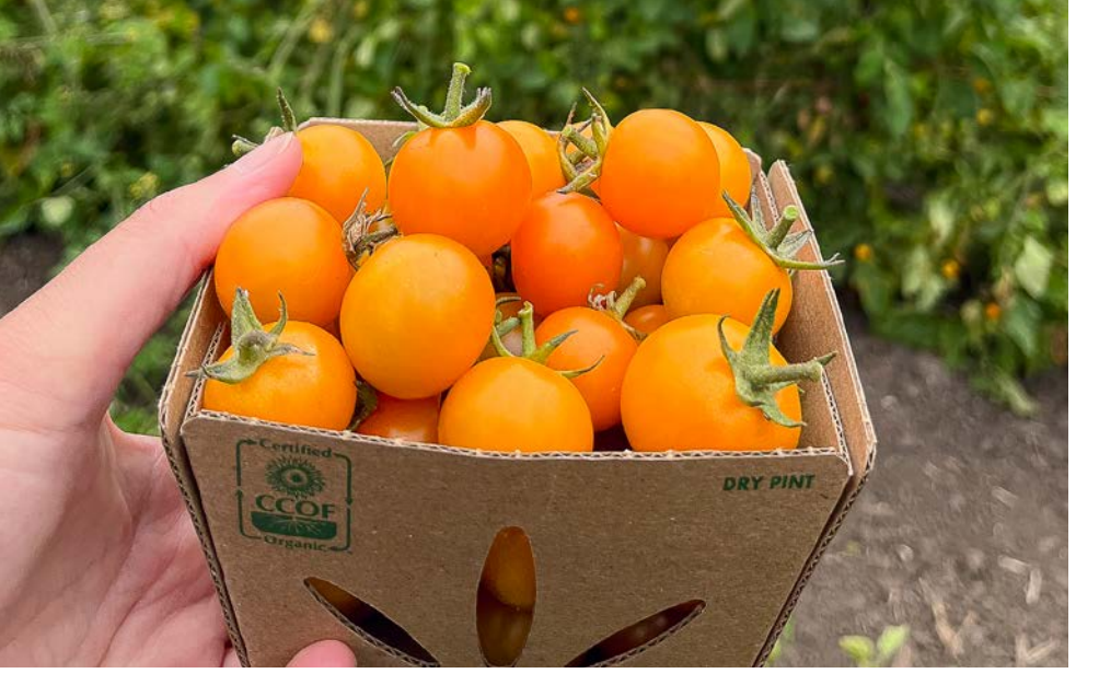
Organic sungold tomatoes from Opal Creek Farm in Davenport.

Farmers with more diversity in crops and over 20 acres were more resilient and able to create new markets and local distribution opportunities.