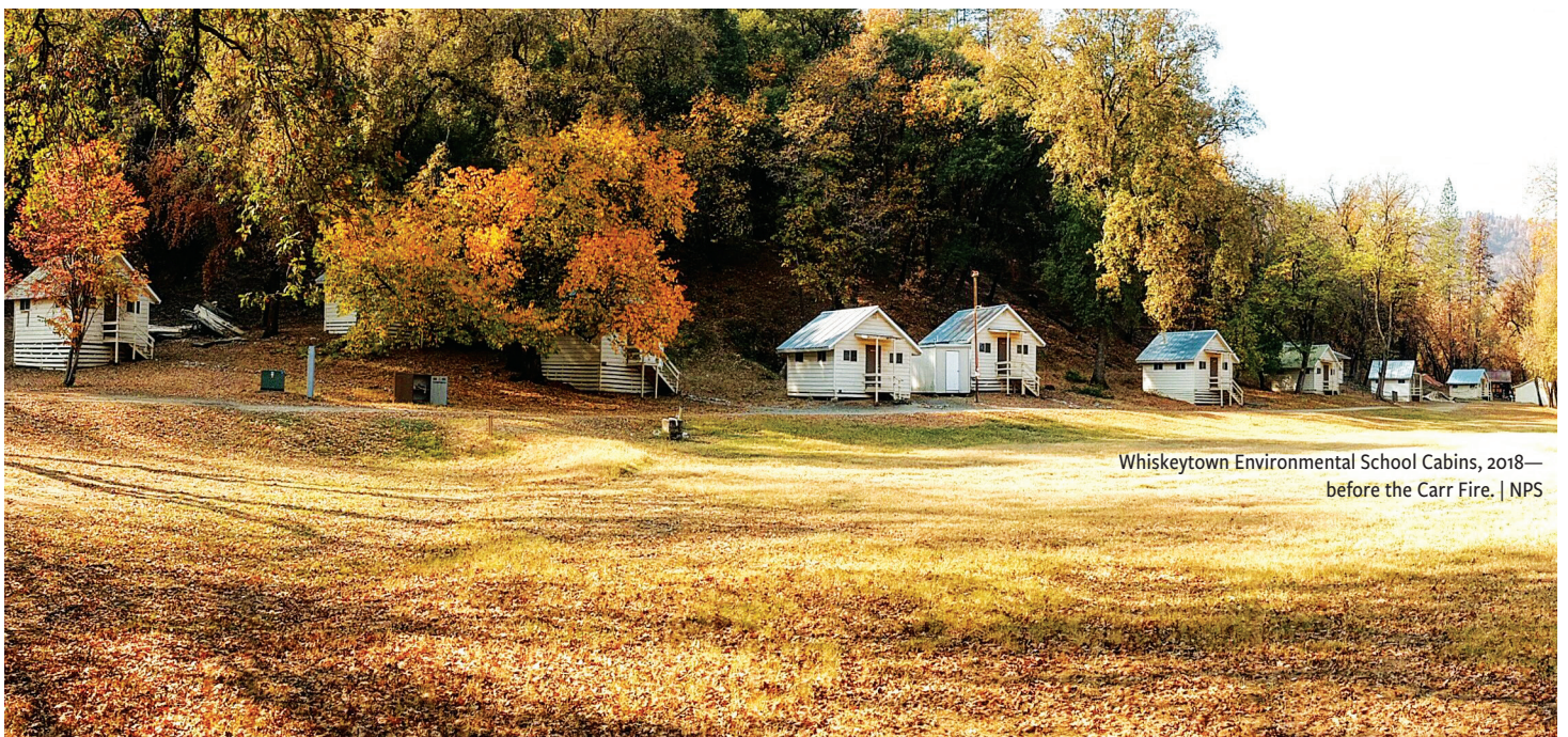
Whiskeytown Environmental School Cabins, 2018— before the Carr Fire.