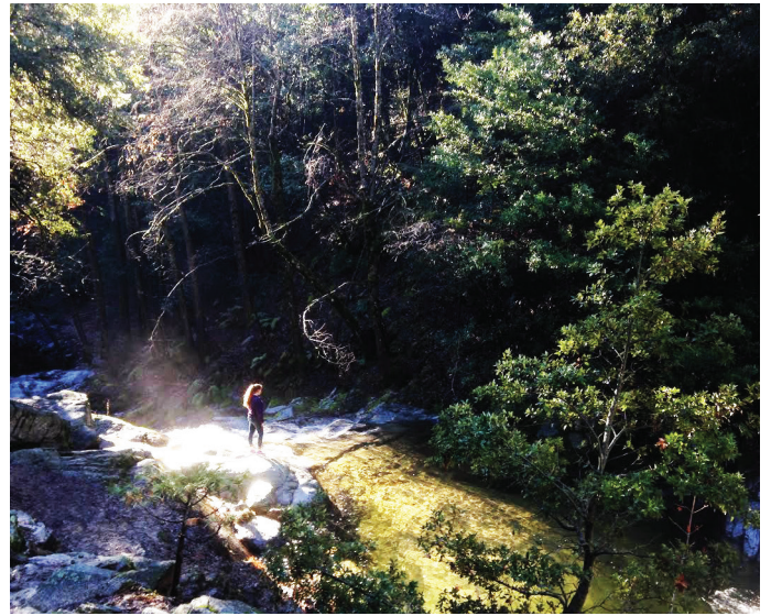
Scenes from Whiskeytown National Recreation Area: (left) Whiskeytown Lake; (right) hiker in sunlight.