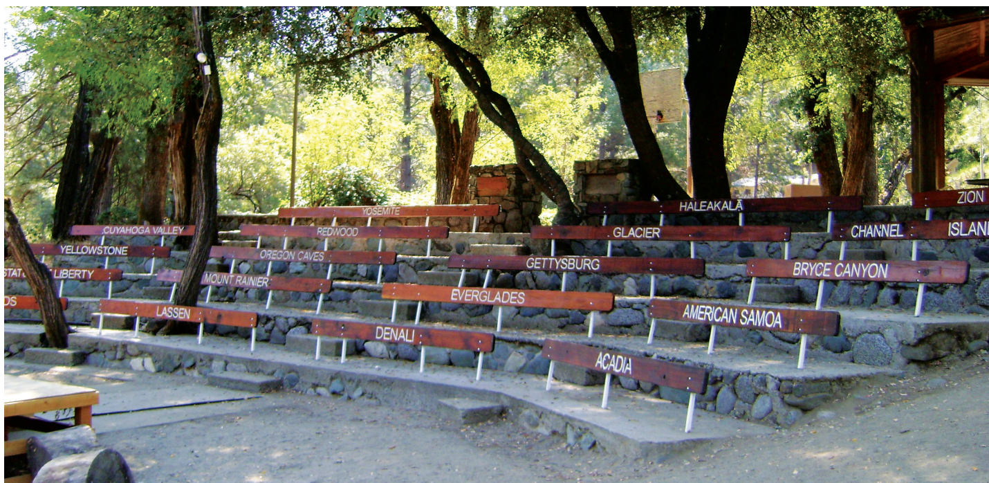
Benches inscribed with names of national parks in the amphitheater at Whiskeytown Environmental School.

EP: Sure! In a typical Whiskeytown Environmental School experience, kids show up and get off the bus, and even though they are only 12 miles west of Redding, from their excitement, you would think they had just set foot in another country. They are amazed and have heard about this place from parents, siblings, and friends, so the experience has become a rite of passage, long anticipated. For the next five days, their world is the camp. They sleep in these tiny, old cabins, which have a legacy in the community. When people come up to us, they say, “I remember the number of my cabin, I was in Cabin 11!” They remember this place for the rest of their lives! Cabin groups are named for national parks; there is a Yellowstone, Yosemite, and a lot of lesser known parks as well, such as Lassen and Channel Islands. This becomes their group identity, so when they gather at the outdoor amphitheater for songs and campfires, they sit on benches inscribed with the same park name. On the final