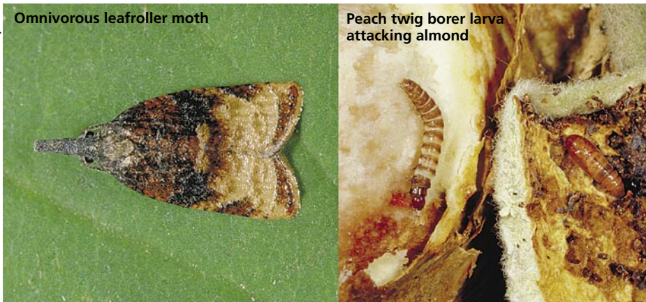
TABLE 1. Novel insecticides primarily targeting Lepidoptera*

Emamectin benzoate is used primarily against pests in cole crops and lettuce. (It is registered for cotton in other