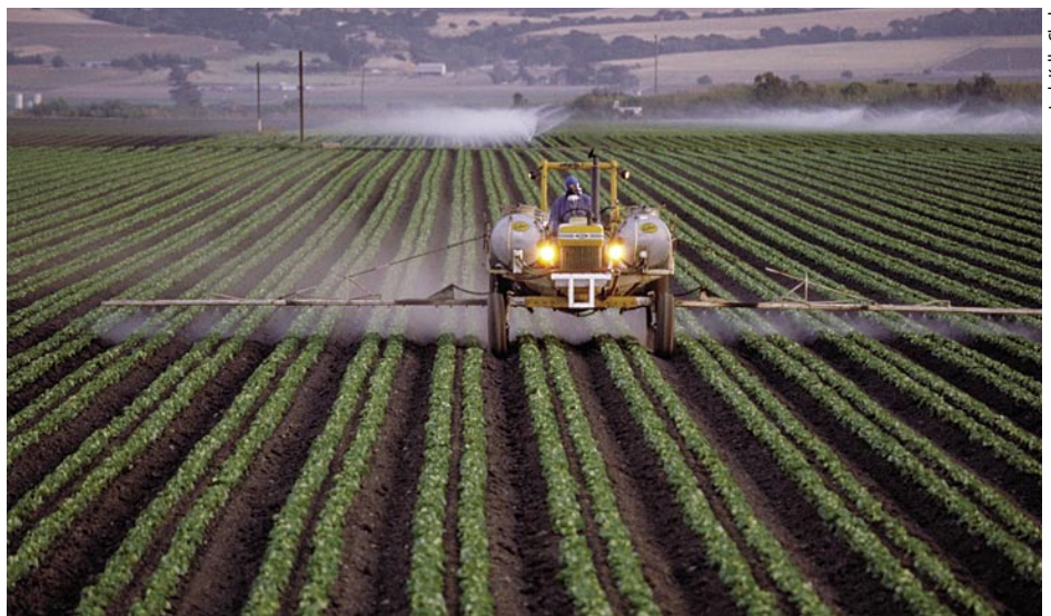
Jack Kelly Clark

The crops for which tebufenozide is currently registered include cole crops, cotton, grapes, lettuce, tomatoes and some nuts, pome and stone fruits. Low levels of resistance to tebufenozide have been found in codling moth ( Cydia pomonella ), beet armyworm and obliquebanded leafroller populations that were not exposed to this insecticide (Moulton et al. 2002; Ahmad et al. 2002), suggest-