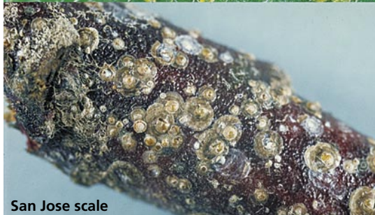
San Jose scale