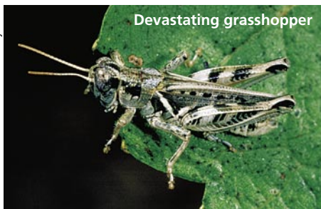
TABLE 4. Current uses of diflubenzuron in California