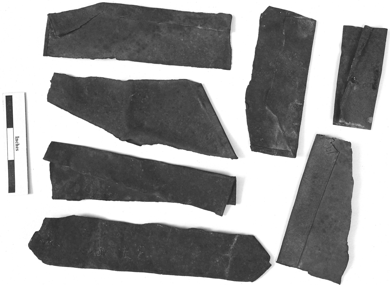
Figure 3. Possible tin can tools, House 13.

The possible can tools were examined by Eugene Hattori (personal communication 2002), who observed use wear on one of the elongate specimens (PH2-024) and pointed out that projections occur on several of the edges. He suggested that this type of tool would have been suitable for splitting willows. He also observed that the triangles had been manufactured by cutting a strip of can with shears, as evidenced by the fact that they were swept down on one side. The pieces were turned as they were cut. Hattori suggested that the triangles might also be blanks for another type of artifact.