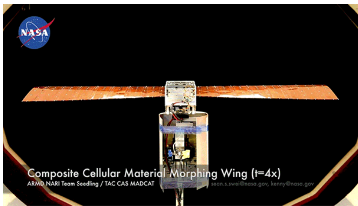
Figure 3: Researchers' morphing wing can twist and change shape seamlessly when pressure is applied to each wingtip. In the public domain.

evolution prove the same thing—the most efficient fliers use their wings as undivided bodies, not structures consisting of individually controlled flaps or ailerons.