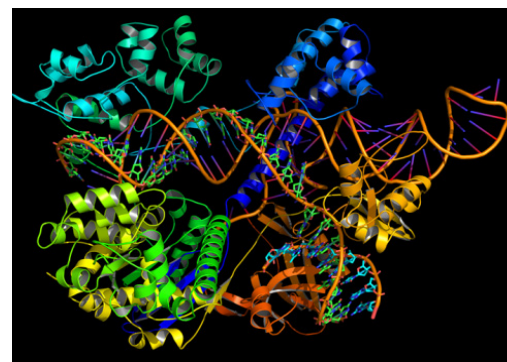
Figure 2: CRISPR Cas-9 protein 3D structure

continue to plague many underdeveloped communities would be greatly suppressed. But the conceivable applications of CRISPR don't stop there. CRISPR could also be very useful in the treatment of genetic disease; specifically, Down Syndrome has been heavily discussed in this regard. Children with DS have impaired language skills, learning difficulties, and both short and long term memory deficits. CRISPR could well be the specific tool required to alter the expression of DS, via either the silencing of an entire chromosome or deleting the specific gene associated with DS. Notably though, this treatment implicates gene editing from within the embryo, based on the fact that the main window to prevent cognitive impairment occurs before birth. 10 In addition to DS, CRISPR may also become an efficient form of cancer therapy. After further developments, CRISPR could be used to edit immune cells to make them better at fighting cancer, and these cells could be injected into cancer patients. On a similar note, more research on CRISPR could lead to the ability to edit a cell and completely delete the region that contributes to HIV - thereby curing a patient of a chronic disease.