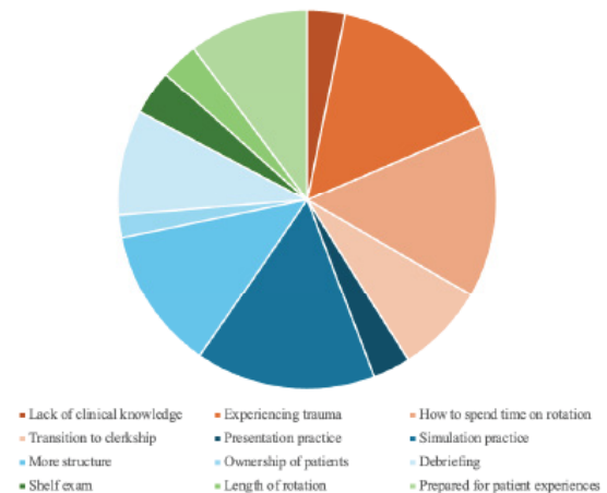
Figure 2. Breakdown of code frequency represented in student feedback. First clinical rotation challenges are represented in orange. Emergency medicine clerkship specific challenges are represented in green. Clerkship enablers are represented in blue.