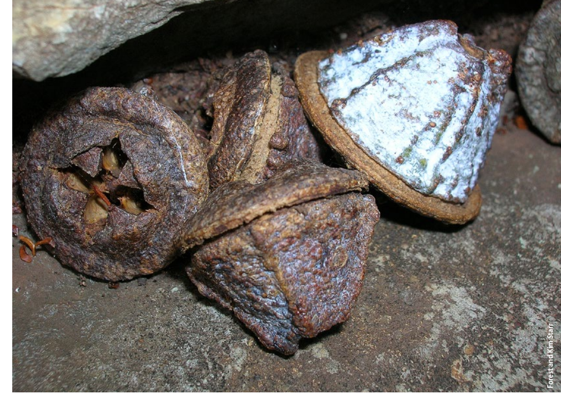
Blue gum eucalyptus trees can produce a large quantity of seeds in woody capsules, but germination rates are generally low.

Fire regime changes and fire hazards. Blue gum was most frequently planted in