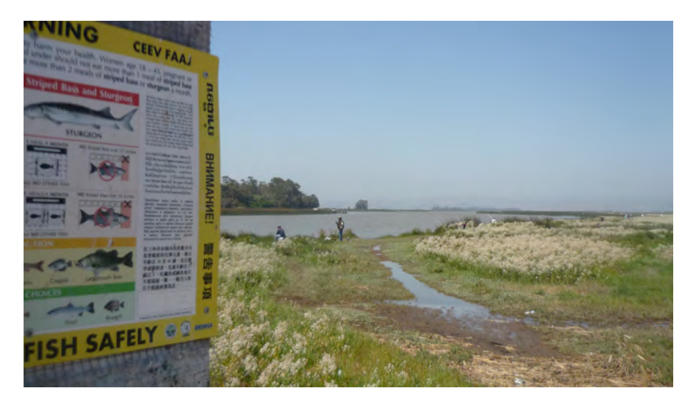
Figure 1. Anglers fishing near advisory sign at Grizzly Island.