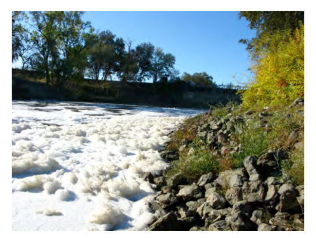
Figure 8. Soapy Waters at Knight's Landing.

fishing in this area, but for many it is just outside of earshot.