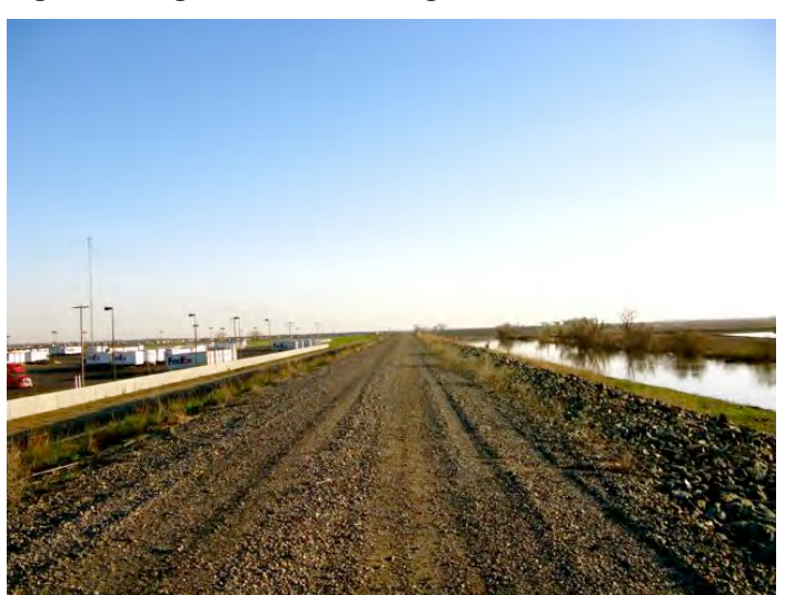
Figure 3. Levee at Lisbon Slough.