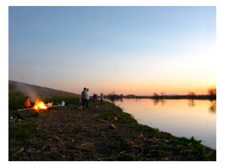
Figure 4. Anglers at Lisbon Slough.

This small stretch of land, water, and wetlands in West Sacramento is a confluence of historical and present day