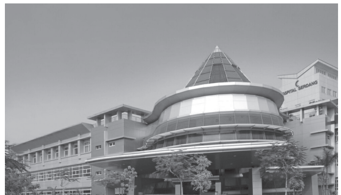
Figure. Hospital Serdang, located in Selangor, Malaysia is approximately 15 miles from the Malaysian capitol of Kuala Lumpur.

Our team had to respond within 12 hours by order of our National security council. We had several roadblocks and issues. First the disaster occurred over the holidays and many staff was on leave. The majority of medical personnel did not have a valid passport. We had to coordinate mobilizing medical personnel from various hospitals urgently. We had inadequate stockpile of equipment and medications and had to pool our resources from several hospitals and clinics to meet the sudden demand. Deployment briefing had to be done at the airport and on the plane. However, post deployment post mortem was done which included psychological assessment.