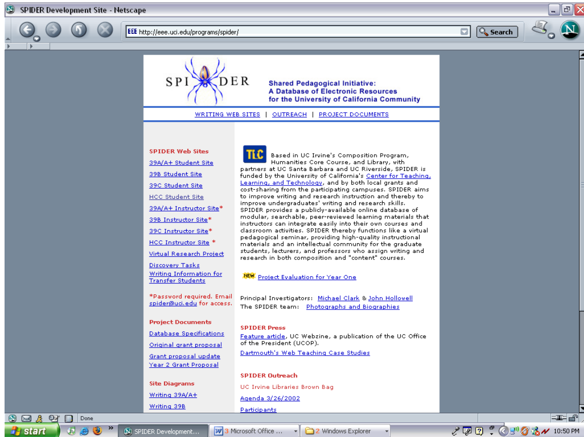
Figure 3: The SPIDER Page (2001-2002)