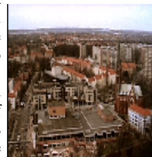
View of Frankfurt/Oder from the "Power Tower"