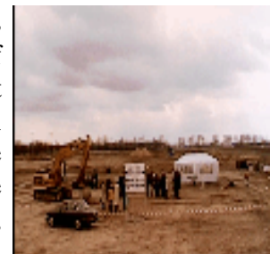
The site of "Asia Cars"

The strongest indication of the importance of place in the film is its focus both on the danger that global culture poses to local identity and its insistence on emphasizing the specific geographic features of Frankfurt/Oder as a form of resistance. The exile of the characters is highlighted by the permeation of their local culture by the global language of English and its pop music, the commodification of what was once the heart of a home, the kitchen, and the push to develop Frankfurt/Oder so that it can be incorporated into the global economy. The "Dauerpower vom Power Tower," the line that Chris uses to identify his broadcast, is a direct challenge to the staying power of local identity. Early in the film every radio is tuned to this show that plays hits from the past "24 years, 24 hours a day," an arbitrary mix disconnected from the historical and cultural context that produced the music. This disconnect characterizes the shopping experiences of the characters as well. When Ellen drags Uwe out to look at new kitchens, her final effort to transform their apartment into a place where she can fit