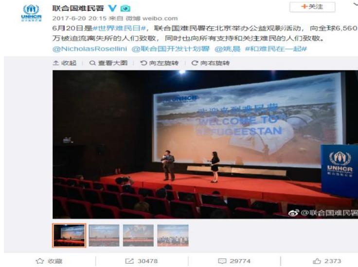
Fig. 2. UNHCR’s Weibo Message on June 20, 2017.

The Weibo post unexpectedly caused an internet uproar and received 29,774 predominantly negative comments versus 2,373 likes. Netizens assumed that the UNHCR, Yao Chen, and the media, were all lobbying the Chinese government to accept refugees from Syria and North Africa and thus resorted to social media and microblogs to preempt such a move. An online news story falsely claimed that “Local people in Sanhe [in Henan Province] confirmed it. It’s real. Refugees get free housing. They do not need to work. It’s shocking, not just in Beijing, UNHCR has refugee settlements in more than 20 cities in China. Refugees get allowances of over ¥3,000 per month” (“Let Germany Tell Yao Chen What Becomes of Standing Together with Extremist Refugees”). Alarming and fact-bending posts and online trolls stoked people’s fear (“Let Germany Tell Yao Chen”; “History Warns China”; Li; “Internet Rumor”; “Why Do Chinese Dislike Refugees?”). 5 Panic spread and anonymity allowed racist, nativist, and Islamophobic comments to flourish (“What’s Wrong”).