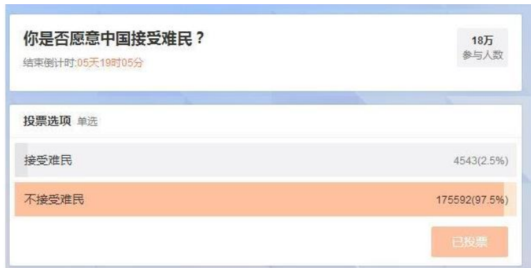
Fig. 4. A Weibo poll about public willingness to accept refugees into China.

A Weibo user launched an online poll, asking the public: “Would you like China to accept refugees?” In a short period of time, 180,000 people voted but only 2.5% indicated willingness to accept refugees (Figure 4) (“What’s Wrong”).