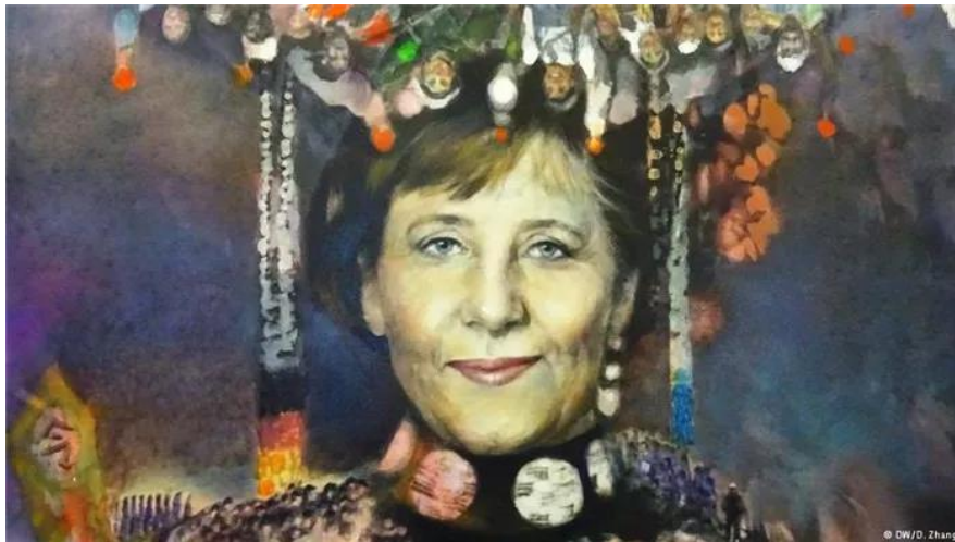
Fig. 1. The Crown ( Die Krone , 2018) by Jiny Lan

When the Syrian refugee crisis rocked Europe in fall 2015, Angela Merkel prodded her nation to take up the challenge (“Wir schaffen das!”). Subsequently, over a million refugees entered Germany. Reactions to her momentous decision both within Germany and in the world were deeply divided (Alexander, 2017; Steinbeis and Detjen, 2019). The influx of refugees into Germany was vividly captured in a painting by a Chinese artist living in Germany, Jiny Lan. In The Crown ( Die Krone , 2018), Lan painted Angela Merkel wearing a smug smile and a style of crown associated with royal women at the Qing Dynasty court. In Lan’s depiction, the chancellor resembles the Empress Dowager Cixi—one of the most powerful women in Chinese history, but also a leader with a contentious legacy (Figure 1) (“Jiny Lan”). 1