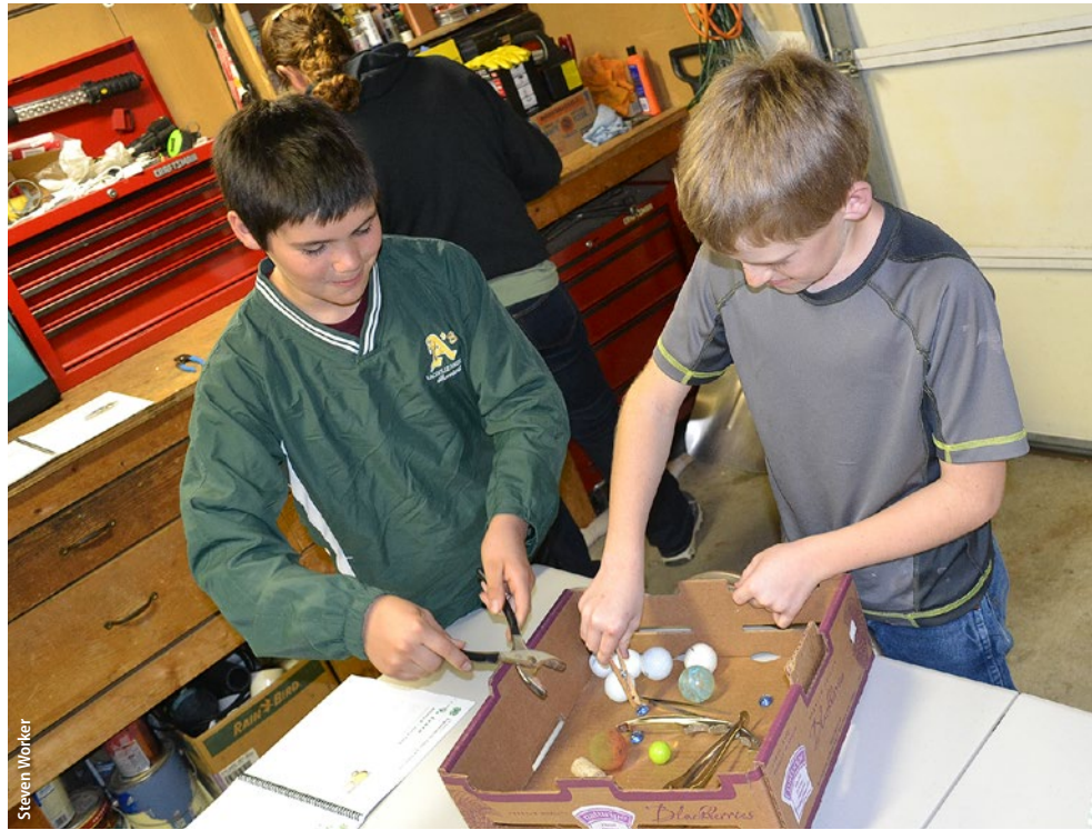
Before adding grippers to their devices, youth experiment with picking up balls with different types of grippers (learning activity participation structure).

I extend my appreciation to Cynthia Carter Ching, Lee Martin, and Tobin White for their guidance on the dissertation research from which this article was developed.