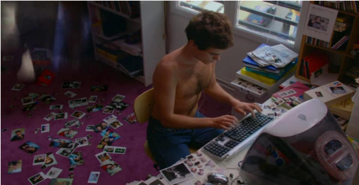
Fig. 8 Xavier (Romain Duris) in Cedric Klapisch's L'Auberge Espagnole (2002)

change instead of asserting the body's presence. As part of Xavier's development, he begins to shed his excess 'baggage,' including his girlfriend(s) and, ultimately his clothes. Born anew in front of his computer in the scene described above, he hovers between the weight of his body and the weightlessness of his writing. His discarded 'baggage' becomes interwoven into the sinuous meat of his autobiographical production. In fact, Klapisch moves from this scene directly to a final shot of Xavier running on a tarmac, arms spread wide like an airplane. Like the Europe figured in EU information campaigns, he is becoming weightless, taking off into the ether of the disembodied networks (data cables) that are the motor of the filmic narrative.