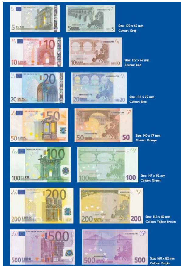
Fig. 1 Robert Kalina’s “Ages and Styles of Europe” designs for the Euro https://www.fleur-de-coin.com/images/eurocoins/banknotes/specifications.jpg

The new Euro notes were conspicuously devoid of human bodies. Instead of portraits, Robert Kalina’s designs under the rubric of “Ages and Styles of Europe” and “Abstract/Modern Design” featured a series of architectural passages: windows and bridges. 22 These passageways were inventions, composite designs intended to represent the progression of “European” architecture from antiquity to the present as an evolution of infrastructural accomplishments. They appear simply as unbounded mechanisms of extension and passage, hovering above maps from which borders are erased and the edges of Europe appear to merge seamlessly with an expansive colored ground. Devoid of human figures, we see simply a materialization of financial interconnectivity that mirrors the function of the bills themselves which travel across space, connecting one economic interaction with another. 23