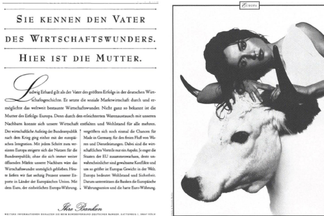
Figs 9-10 Advertisement by Scholz & Friends Dresden GmbH/Berlin for the Deutscher Bankverein, 1996

in 1996 indicates that the reference to the myth of Europa and the bull held a renewed currency at the time, specifically in relation to worries over monetary union. A young woman stares out from the advertisement enticingly, leaning between a white bull's horns; "you know the father of the Wirtschaftswunder " the text reads (referring to former German chancellor Ludwig Erhard), "here is the mother: Europa bedeutet Wohlstand und Sicherheit " ("Europe means wealth and security"). It might initially seem odd that the topos of rape, seduction, and trickery associated with the myth might suggest security, yet Moodysson's film offers a means for reflecting upon how the story could serve as a form of Freudian wish-fulfillment which enjoyed a peculiar resonance at the time.