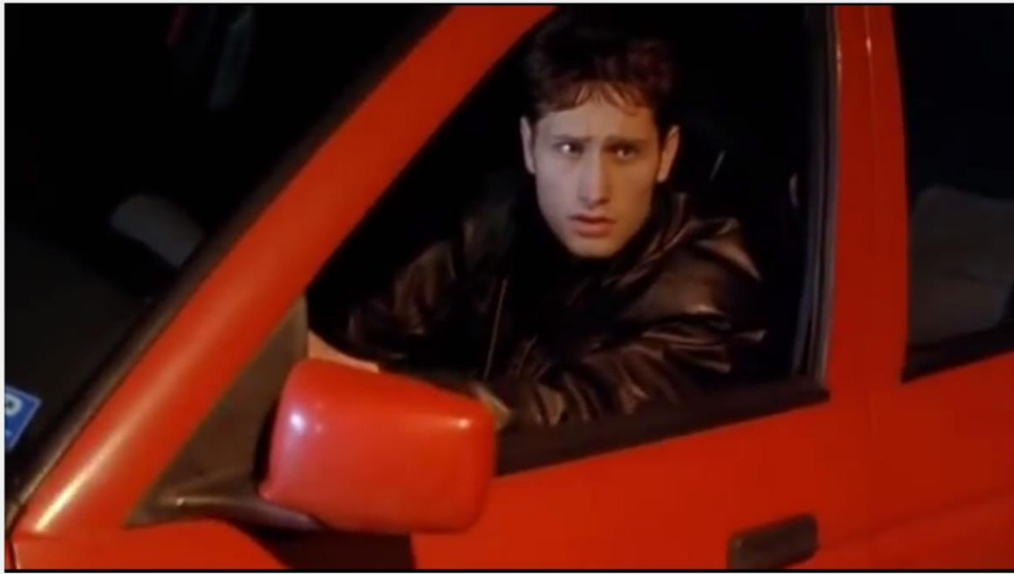
Fig. 11 Andrej and his car in Lilya 4-ever (Lukas Moodysson, 2002)

Likewise, while at a disco, Lilya makes the acquaintance of Andrej, a handsome young man with a big red car. Putting up a gentle and caring front, Andrej disarms Lilya and fools her into thinking that they can escape to Sweden together and start an honest life with gainful employment as vegetable pickers. Like Europa, Lilya boards the moving vehicle (i.e. the bull), only to find herself tricked. Andrej provides her with a fake passport and a ticket to Malmö and sends her to Sweden with false promises that he will join her later. Upon her arrival, the trick reveals itself immediately. Not only are there no vegetables to pick, but also there is no “employment”—in the sense of contractual labor—awaiting her.