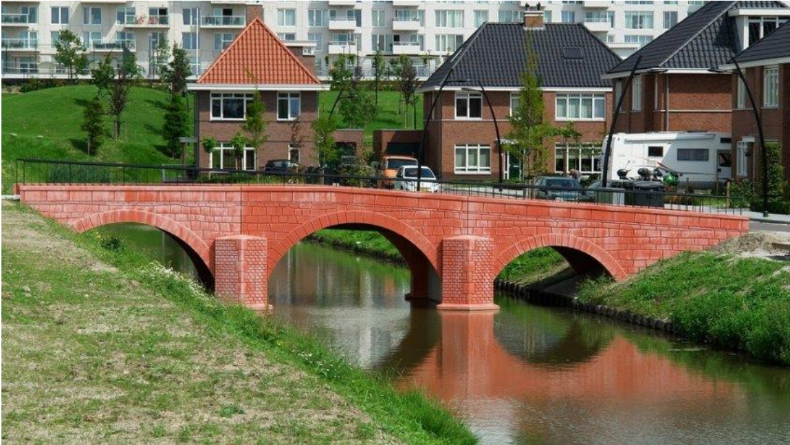
Fig. 2 Robin Stam's realized Euro bridges in Rotterdam

( http://www.designboom.com/design/fictional-bridges-on-euro-banknotes-realized-by-robin-stam/ )