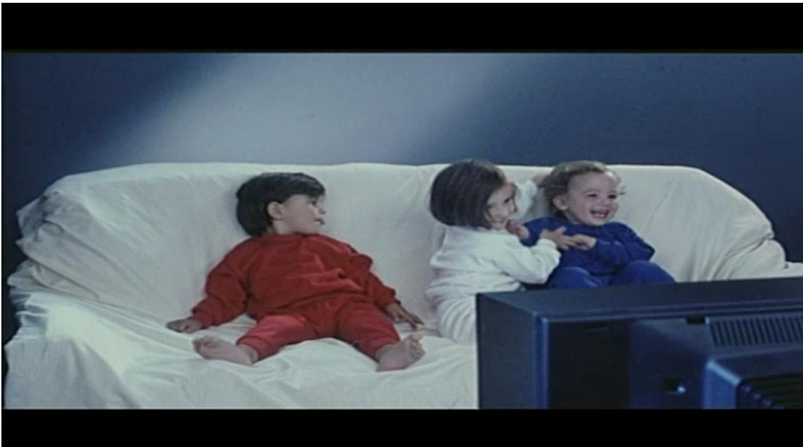
Figs. 3-4 The Tree of Europe (Daniel Tardy, 1988)

The official EU visual rhetoric is thus one that emphasizes the crossing of borders, whether through erasure (the currency has no boundaries) or through figures like trees or vehicles (trains and planes) that move, like money and goods, from one place to the next and grow. As Dyson has observed, Europe often appears today in a form analogous to a balance sheet tracing the production of surplus; we might see the multiple references to biological development in the films as a kind of visual parallel to this model, conflating physical growth with the technocratic forms of the balance sheet and the graph). 29 This conflation is perhaps most present in a series of posters promoting economic union which depict an hourglass filled on top with coins from the old national currencies that merge, in time and space, into a colossal Euro coin located in the bottom part of the glass.