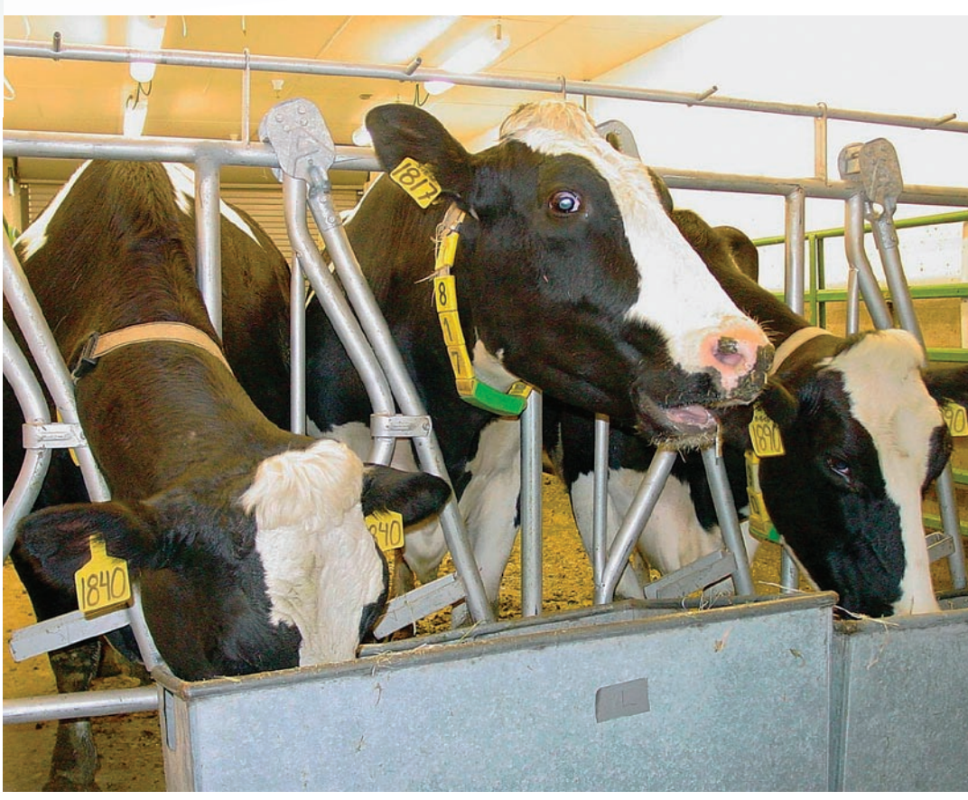
Holstein dairy cows were housed in an environmental chamber for 24 hours to accurately measure all their emissions of greenhouse gases, including methane and nitrous oxide; the cows were fed a total mixed-ration diet.

The three major anthropogenic greenhouse gases are carbon dioxide, methane and nitrous oxide, and agriculture contributes significant amounts of each. The IPCC estimated that globally, agriculture contributed 10% to 12% of anthropogenic carbon dioxide (CO<sub>2</sub>), 40% of methane