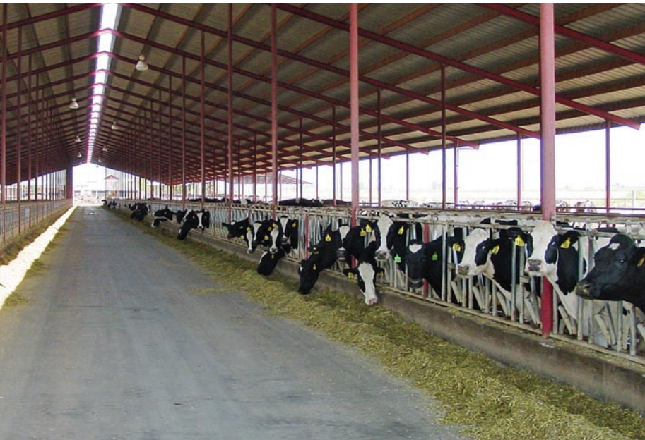
Strategies to reduce methane emissions from dairies include modifying cattle diets to enhance digestibility and improving milk production so that fewer cows are needed.

Volatile organic compounds. In a UC study, Shaw et al. (2007) showed that major volatile organic compounds from cows include methanol. This study also showed that of the volatile organic compounds from cows, the reactive (ozone forming) fraction was 6 to 10 times lower than the value for cows and fresh waste that California regulatory agencies have historically used to develop volatile organic compound inventories for ozone attainment in the San Joaquin Valley. Ozone contributes to global warming and thus all such ozone precursors should be considered in climate-change discussions.