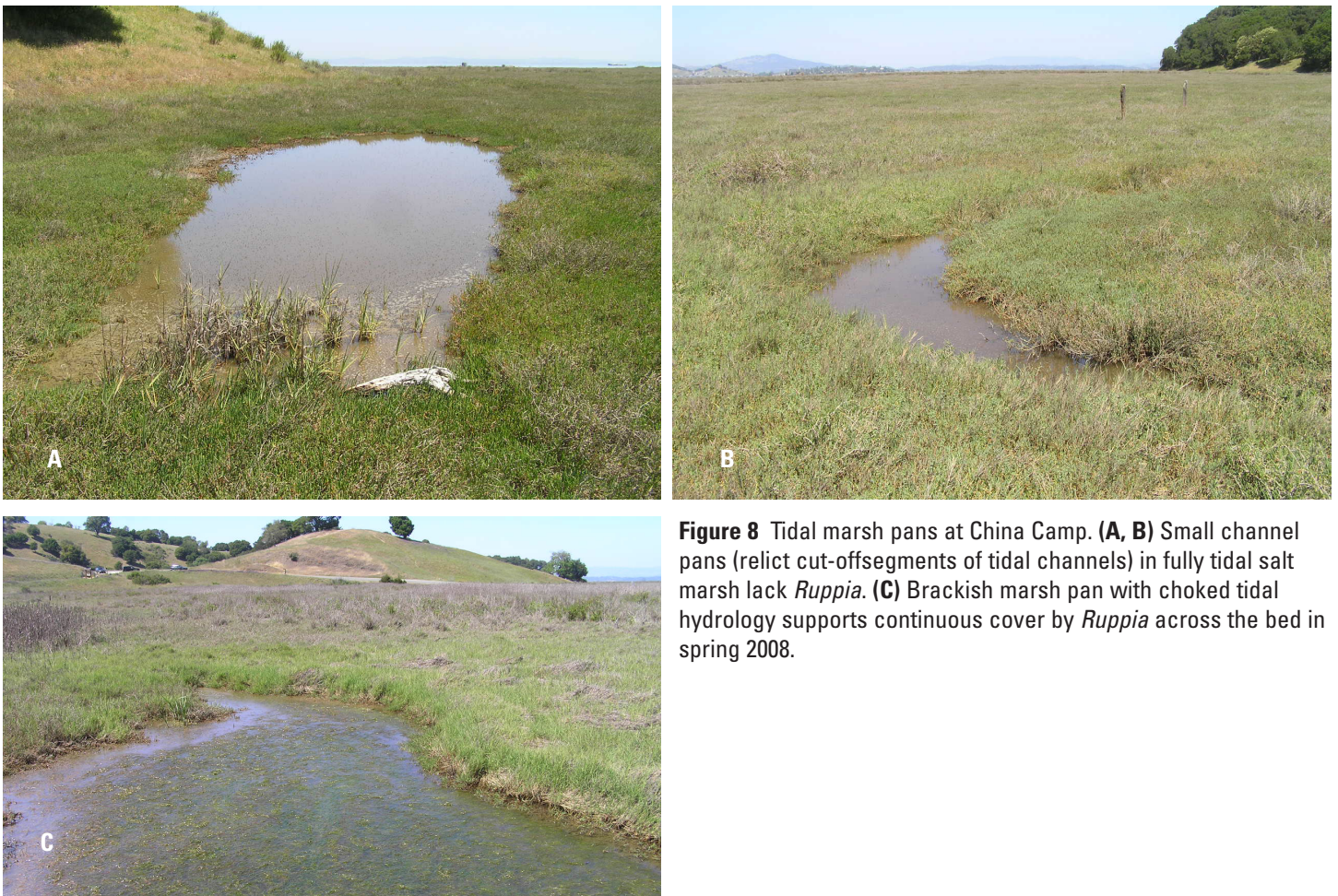
Figure 8 Tidal marsh pans at China Camp. (A, B) Small channel pans (relict cut-off segments of tidal channels) in fully tidal salt marsh lack Ruppia . (C) Brackish marsh pan with choked tidal hydrology supports continuous cover by Ruppia across the bed in spring 2008.

evergreen forest, riparian woodland, and freshwater marsh; Howell and others 2007) contact or intergrade with tidal salt marsh, they also form narrower zones of terrestrial–tidal marsh ecotones on original soils, some of which support distinctive and regionally uncommon plant assemblages. Dikes, ditches, and agricultural conversion have intensively altered or completely destroyed former terrestrial ecotones that were prevalent in most of the San Francisco Estuary’s tidal marshes, leaving a small number of prehistoric tidal marsh ecotones in the San Pablo Bay and Suisun Marsh, and extremely few in San Francisco Bay (Baye and others 2000; Boyer and Thornton 2012). China Camp retains some of the most intact and diverse, distinctive examples of terrestrial ecotones of tidal marsh in the estuary, although they cannot be assumed to represent the historic range of terrestrial ecotone variability in the North Bay.