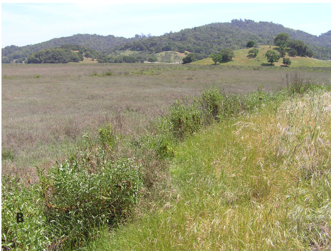
Figure 10 High salt marsh ecotone with valley grassland of south-facing hillslopes is typically dominated by (A) co-dominant Elymus triticoides and Juncus balticus . (B). Grindelia abundance is typically confined to tidal creek banks rather than natural upland edges, but can locally dominate the lower edge of the high marsh zone. June 2008.

Pinole; Petaluma Marsh; Rush Ranch; Suisun Marsh). E. triticoides ecotones appear to have expanded at China Camp in the last two decades, as at Rush Ranch. The relative abundance of Juncus balticus in hillslope edges of tidal marsh increases in the vicinity of hillside seeps and road culverts, and on north-facing slopes (Figure 11); E. triticoides tends to dominate the assemblage otherwise. Both clonal perennial graminoid species exhibit relatively low salt tolerance compared with adjacent salt marsh halophytes, but they extend into the upper zone of Sarcocornia –