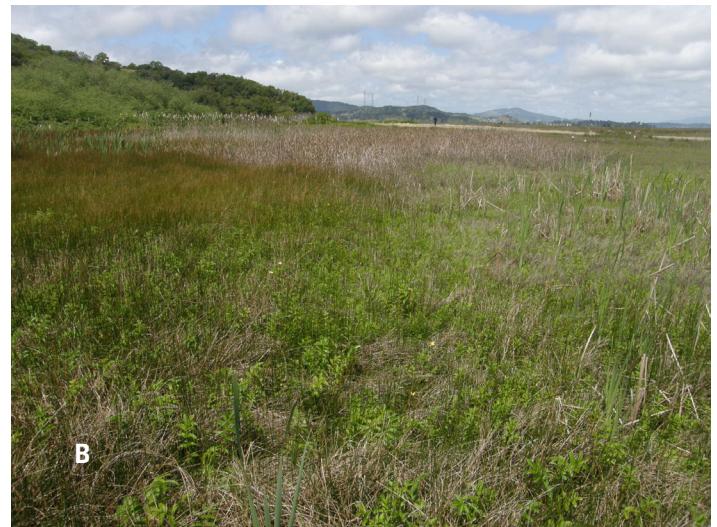
Figure 7 Brackish tidal marsh, China Camp. (A) Brackish tidal marsh (choked tidal flows through culverts beneath San Pedro Road) of Miwok Valley Marsh exhibits a patchwork of Bolboschoenus , Distichlis , and Sarcocornia -dominated vegetation. Grindelia dominates channel and ditch bank crests. Oak woodland and valley grassland flank the marsh. Note riparian woodland and freshwater marsh in background, associated with alluvial fan of a small canyon stream. (B) Brackish marsh gradient between terrestrial riparian thickets ( Salix lasiolepis ) and Sarcocornia salt marsh, with uneven, patchy zones of Carex praegracilis , Juncus balticus , Potentilla anserina , and Typha latifolia . Back Ranch Meadows Marsh. April 2011.