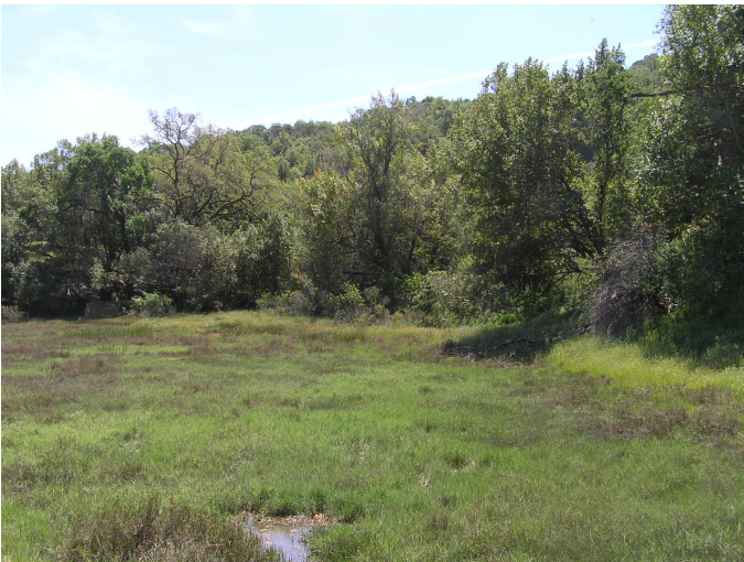
Figure 12 Riparian woodland and brackish to fresh Cyperaceae-dominated marsh ( Juncus balticus , Carex praegracilis , Eleocharis macrostachya ) border tidally choked brackish Sarcocornia – Distichlis marsh west of San Pedro Road

ing dense shade and litter-dominated tidal marsh edges. Quercus agrifolia , Heteromeles arbutifolia , Baccharis pilularis , Toxicodendron diversilobum , and Umbellularia californica rooted above the tide line extend branches up to 2 m or more into tidal salt marsh at some locations where they dominate surface cover.