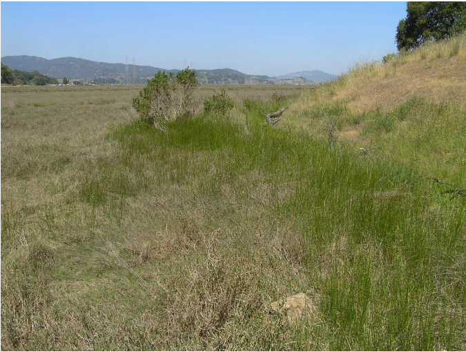
Figure 11 Juncus balticus locally dominates the high salt marsh ecotone and intergrades with Distichlis -dominated salt marsh along the northwest slope of Turtle Back Hill