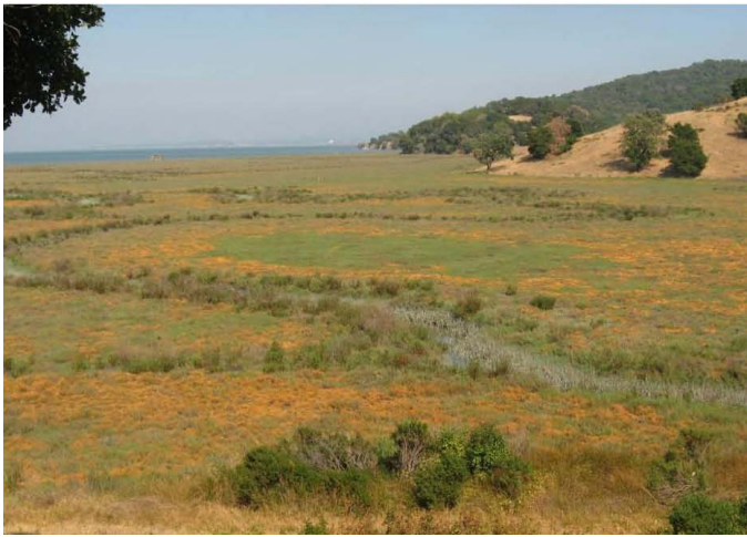
Figure 3 Extensive infestation of Sarcocornia -dominated prehistoric salt marsh by annual parasitic Cuscuta salina during a drought year (July 2008). View southeast from Turtle Back Hill.

coastal salt marshes (Callaway and Pennings 1998; Grewell 2008), and Cuscuta appears to contribute to the vegetation gaps in the high salt marsh terrace of China Camp, along with wrack-deposition processes. Because of the strong seasonality and annual variability in Cuscuta cover, it has sometimes been under-estimated as an important or seasonally co-dominant component of China Camp's tidal marsh vegetation (e.g., Li and others 2005).