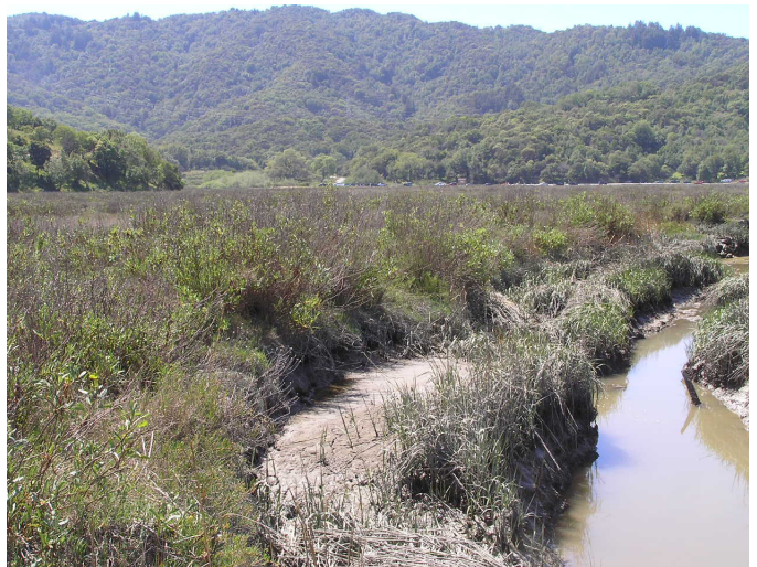
Figure 6 Tall (>0.6 m), dense Sarcocornia and Grindelia stands dominate the high marsh above a relict channel scarp along a large tidal creek. Spartina foliosa dominates the slump blocks below the scarp, accreting recent sediment deposits in the sheltered lee of the blocks and in the canopy.

The Miwok Meadows Marsh plain supports a mosaic of patches dominated by Distichlis , Sarcocornia , Bolboschoenus , and Jaumea , with Grindelia again dominating narrow zones that borders tidal creeks. Beneath the Sarcocornia canopy, a sparse ground layer of Isolepis cernua and Juncus bufonius occurs sporadically, particularly near the terrestrial ecotone. During drought years, saline or hypersaline condi-