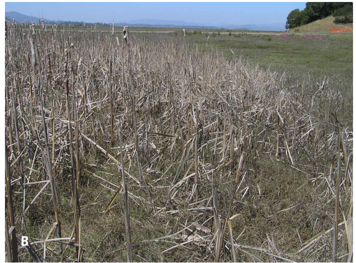
Figure 13 Senescent, moribund stands of Typha latifolia during drought years are rapidly invaded by Distichlis (A) and Sarcocornia (B) in the fluctuating fresh-brackish marsh ecotone

Populations of Chloropyron maritimum var. palustre (syn. Cordylanthus maritimus ssp. palustris ; northern salt marsh bird's-beak, an annual halophytic hemiparasitic forb) have been reported from Bucks Landing, immediately north of China Camp, but this regionally rare plant has not spread into China Camp marshes. In San Francisco Bay, this historically widespread species is restricted to Marin County bay-shores, with the exception of one recently reported population at Newark, in Alameda County (Reder 2011). The annual forb Polygonum marinense occurs locally in high brackish marsh edges of the north side of Miwok Meadows Marsh, and at scattered locations at the southern shorelines of China Camp salt marshes (see Appendix A ). This putative native “rare” salt marsh annual is now widespread in San Pablo Bay, and may be a cryptic, non-native introduced plant (Howell and others 2007; Costea 2012, in Baldwin and others 2012).