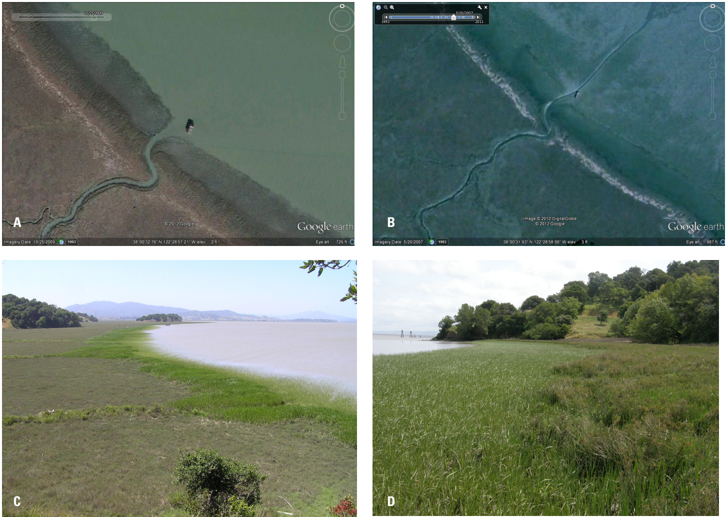
Figure 2 Prograded modern high tidal salt marsh terrace ( Sarcocornia pacifica dominant) with fringing low salt marsh spreading across mudflats below the relict erosional wave-cut scarp ( Bolboschoenus maritimus landward and Spartina foliosa bayward dominant), southwest end of China Camp Marsh. (A) Aerial view of multiple relict erosional scarp boundaries between high salt marsh terrace above remains of Spartina litter wrack-lines (arrow; wrack accumulated around the break in slope at the oldest, inner scarp), transitional and low salt marsh, Google Earth image October 25, 2009. (B) Well-defined Spartina litter wrack-lines along scarp in spring, delineating high marsh terrace and low fringing marsh gradient, May 20, 2007. (C) Oblique view along fringing low marsh, north to Jake's Island (center background). Note low marsh extending into few, simple straight shore-normal tidal channels. (D) Ground view of scarp-defined abrupt Sarcocornia/Spartina zonation. View to southwest, southwest end of China Camp Marsh. April 2011.

between these two marsh sub-units (Figure 1). The high salt marsh terrace is approximately 200 m wide along most of China Camp Marsh between Jake's Island and Chicken Coop Hill, where it fronts the original prehistoric tidal marsh platform and creek system. Southwest of Chicken Coop Hill, the high marsh terrace narrows to less than 120 m wide, and occupies almost the entire tidal marsh profile.