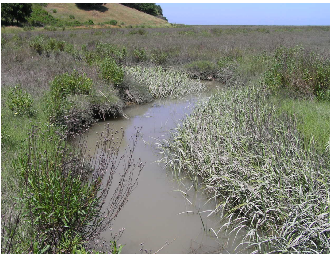
Figure 5 Tidal marsh creek vegetation. Grindelia , Distichlis , and Sarcocornia occupy high marsh above the bank crest. Spartina foliosa occupies the banks and slump blocks.

During years of high rainfall and low channel salinity during the growing season, Bolboschoenus maritimus locally establishes or regenerates in sporadic but sometimes large (up to 5 m long) colonies within tidal creek banks, among dominant Spartina foliosa stands. B. maritimus is otherwise restricted to brackish marsh ecotones associated with terrestrial ecotones of the prehistoric marsh platform.