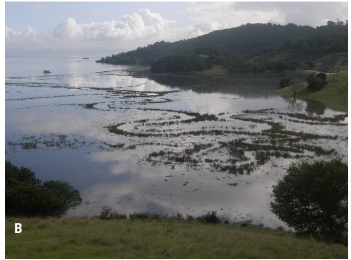
Figure 4 (A) Tidal creek patterning of the prehistoric interior salt marsh plain vegetation: shrubby Sarcocornia and Grindelia dominate the high marsh that borders creek banks; patchy mosaics of Sarcocornia (dominant), Distichlis , and common salt marsh forbs comprise the plain's vegetation. June 2006. (B) Nearly complete submergence of marsh platform vegetation during winter perigean high tide during El Niño winter. View southeast from Turtle Back Hill, January 30, 2010.

stricta var. angustifolia , a perennial subshrub, delineate a zone of tall, dense, diverse high salt marsh that borders the banks of tidal creeks (Figures 4, 5, and 6). Tidal channels are associated with a narrow high marsh zone of tidal drainage and sedimentation gradients that support increased plant species diversity in Petaluma Marsh (Sanderson and others 2000), the other large remnant prehistoric tidal marsh in San Pablo Bay. The zone of creek-patterned high salt marsh vegetation at China Camp extends up to several meters from the edge of creek banks, similar to zonation of the lower-order channels of Petaluma Marsh, in relation to channel size and depth (Hopkins and Parker 1984; Sanderson and others 2000). The tall, semi-evergreen canopy of G. stricta on creek banks at China Camp rises up to approximately 1.0 m above the marsh substrate of natural creek bank levees, and is the only emergent vegetation during the extreme high (perigean) tides of winter that completely submerge the marsh plain (Figure 4), particularly in years of El Niño-elevated mean sea level. Grindelia is almost entirely absent in the marsh plain vegetation of drainage divides, and when it does occur there, it does not develop the robust, tall sub-shrub growth form of tidal creek banks. The abundance and continuity of local, channel bank Grindelia stands, and the size of individual plants, has been observed to decline