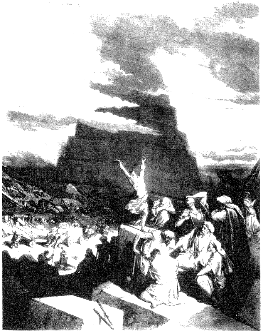
Gustave Doré , 1832–1883, from the “Illustrated Bible” (around 1860), reprinted from Rassegna V (16/4, December, 1983).