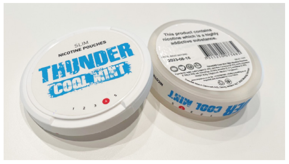
Fig. 1. Bottom and lid of a nicotine pouch tin of Thunder Cool Mint, with the content or "strength" on a numerical scale.

Different brands of nicotine pouches and different products within a brand differ in weight, nicotine concentration and bioavailability, flavour and pouch size. Like traditional tobacco-containing snus, 20–25 nicotine pouches are typically packed in a pocket-sized tin (Fig. 1). In some countries, the tins may have a compartment for discarding used pouches (e.g. Zyn, Ace) (13). The brand names, flavours and pouch sizes (e.g. "slim") are often listed on the lid. In some countries, the nicotine content is described as "strength" on a dot or a numerical scale (e.g. 4 out of 5; Fig. 1, right). The nicotine content varies from brand to brand and may be expressed in mg or mg/pouch. The lack of a requirement for standardized labelling and the resulting variety of expression of nicotine concentration probably confuses consumers. A warning is often placed on the lid or the bottom of the tin. Although such warnings are not required if the product is not regulated as a tobacco product, it may give the false impression that the company is abiding by the provisions under tobacco product regulations.