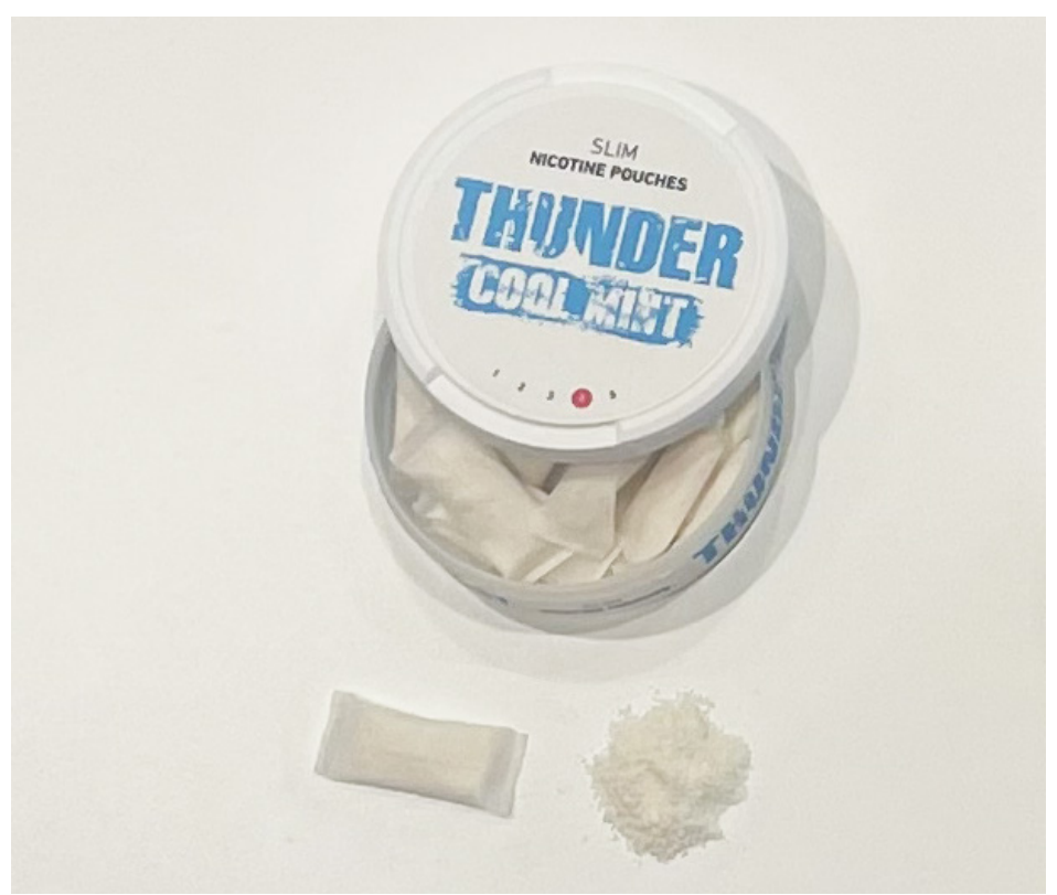
Fig. 2. Nicotine pouch package labelled "slim", a nicotine pouch and its content