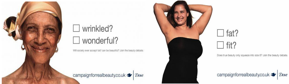
Figure 3: A dove beauty ad that forces women to choose between two extremes: either you are beautiful or you are not beautiful. While this ad seems positive at first glance, it becomes negative once one applies these scenarios to oneself.