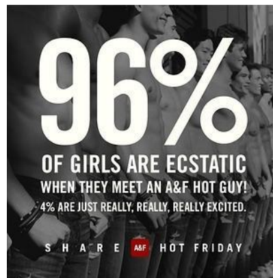
Figure 4: Abercrombie & Fitch male models pose shirtless as they await the Black Friday sale, where excited girls will have a chance to meet them for the first time.

Women's bodies are not the only entities being sold into the advertising market, because men are also stepping into the sensual category of the fashion industry. Although women are more explicitly featured in revealing ads, the same is happening for male models, but to a lesser degree. The popular clothing brand Abercrombie & Fitch has also boarded the train of sexist advertising as seen in Figure 4 , by displaying muscular and shirtless male models in suggestive poses. Such inappropriate advertisements promote not only the product, but sexual intercourse as well.