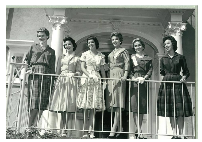
Kappa Kappa Gamma Sorority women standing outside their house in the 1950s<sup>12</sup>

To discuss the Panhellenic community without acknowledging its long history of exclusion would be incomplete. Early sorority life at Cal was characterized by a lack of inclusivity and diversity. From their founding in the 19th century all the way to the 1960s, sororities were very exclusive spaces. Today, the Greek community has certainly come a long way from its elitist and predominantly white population and its historic exclusion of women of color and working-class backgrounds. Over the years, many of Berkeley's Panhellenic chapters have fought to expand inclusion, even going so far as to directly oppose their national or local affiliation's policies. Even so, today the Greek community still remains often at the center of controversy for exclusivity and elitism.