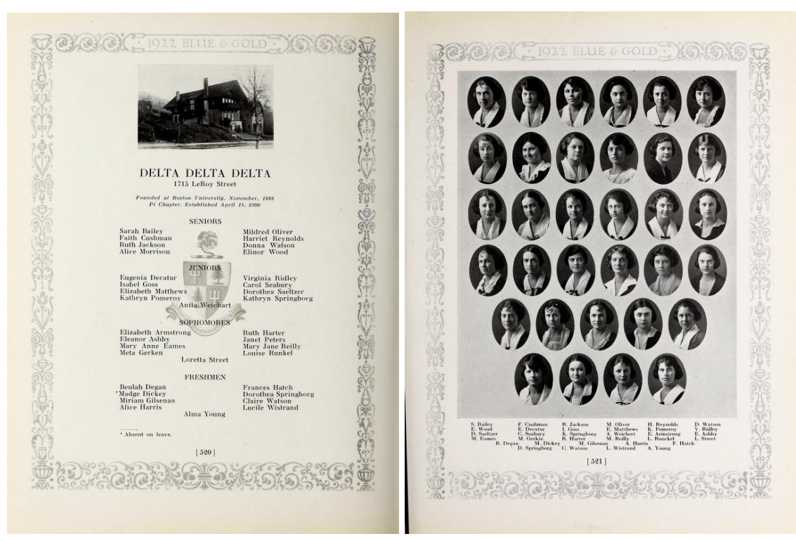
Delta Delta Sorority featured in the Blue and Gold Yearbook, 1922.<sup>34</sup>