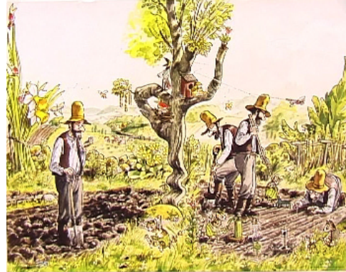
Figure 1: The picture

The picture was shown for about 30 seconds. When the description finished the subject was told to describe the picture freely with his or her own words. The subjects were also specifically told to keep their eyes open during this phase, but that they were free to look where ever they wanted on the white board.