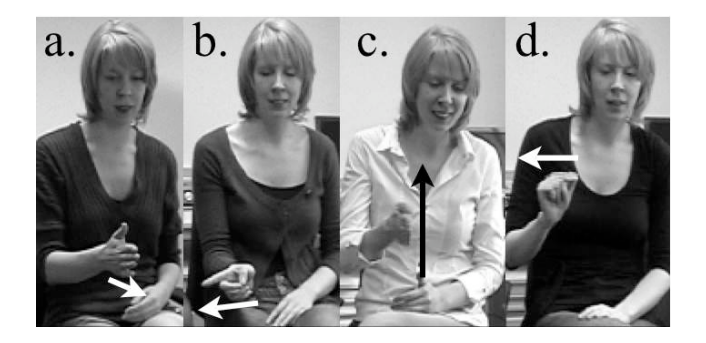
Figure 3: The confederate's path gestures. a: Hand/ Route; b: Finger/ Route; c: Hand/ Map; d: Finger/ Map.

After the confederate's description, the participant turned a page and was to choose which route had just been described, selecting from four alternatives by pronouncing the corresponding letter. No feedback was provided. Then it was the participant's turn to study a route. This route was always on the same scene that the confederate's route had been on. After turning the page (rendering a blank page) the participant described the route to the confederate, who then turned a page and selected one of the four alternatives. This ended one cycle of the experiment. In total each participant perceived and produced five route descriptions.