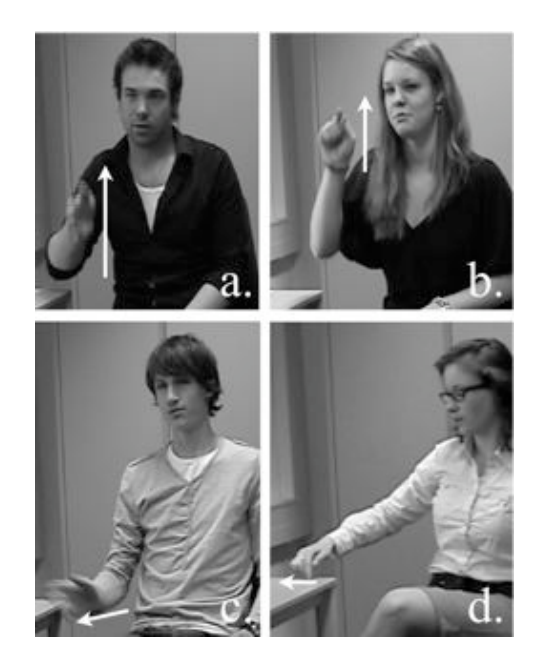
Figure 4: Examples of participants' path gestures (published with permission of the people depicted).a: Hand/ Vertical Map; b: Finger/ Vertical Map;c: Hand/ Route; d: Finger/ Horizontal Map.

The confederate gestured with her right hand. The first direction of a route was always straight, which was depicted with either a forward or an upward movement. These movements were of comparable size. The gesture for the second direction (to the side) was placed relative to the first gesture; it started where the first gesture had ended.