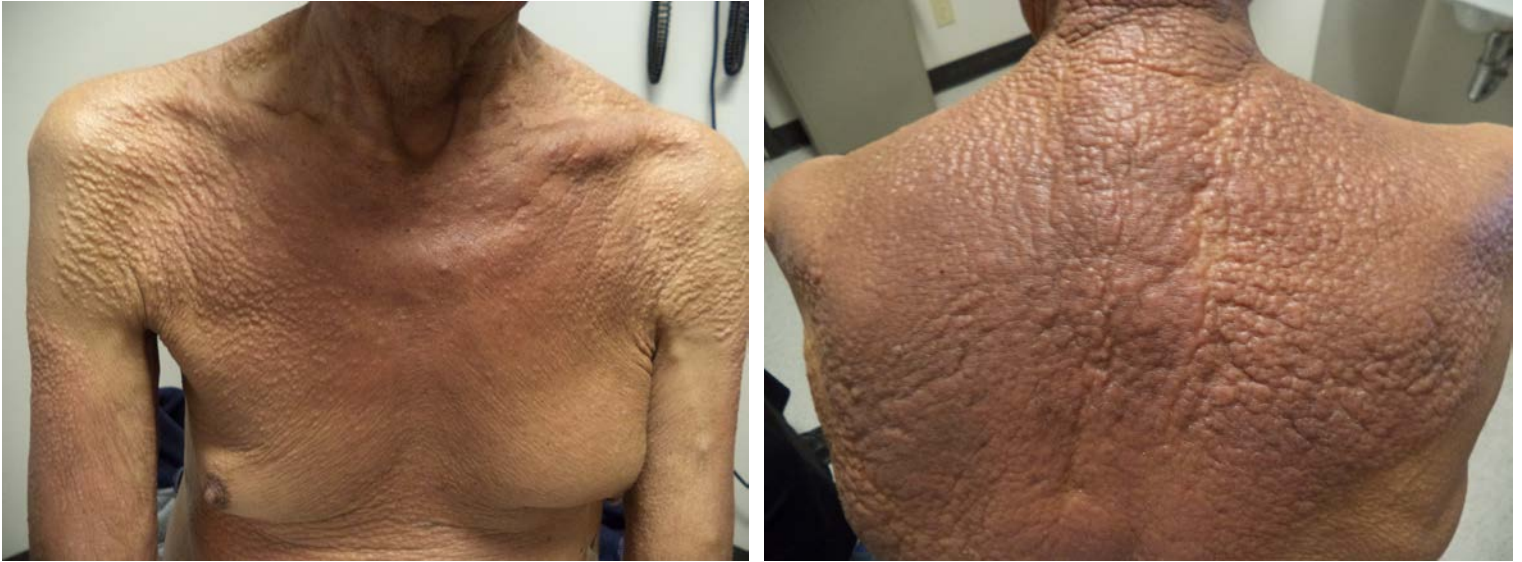
Figure 1. Paraneoplastic plaque-like cutaneous mucinosis is shown in clinical photographs prior to initiation of chemotherapy. Chest (A) and upper back (B) demonstrate diffuse, waxy, and erythematous to skin-colored papules coalescing into plaques.

infiltrate, or neoplastic cells (Figure- 2A). The interstitial mucin was highlighted by colloidal iron staining (Figure- 2B). An elevated thyroid-stimulating hormone level was detected; levothyroxine was initiated, with correction of thyroid function within one month. Serum and urine protein electrophoresis revealed no monoclonal gammopathy. Potent topical steroids and oral antihistamines were prescribed.