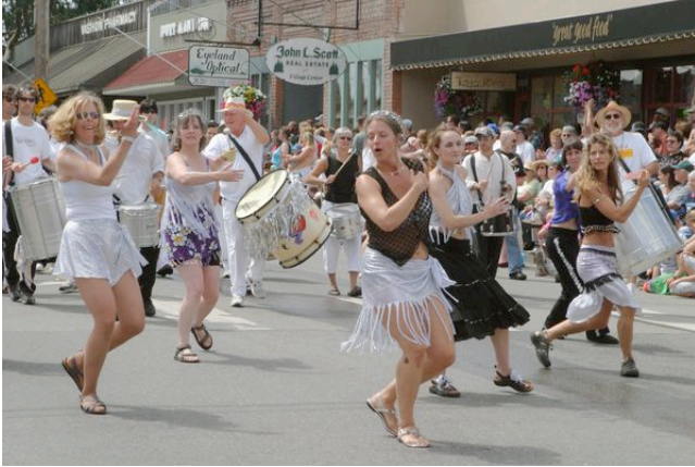
Figure 1. Example of non-threatening photograph.