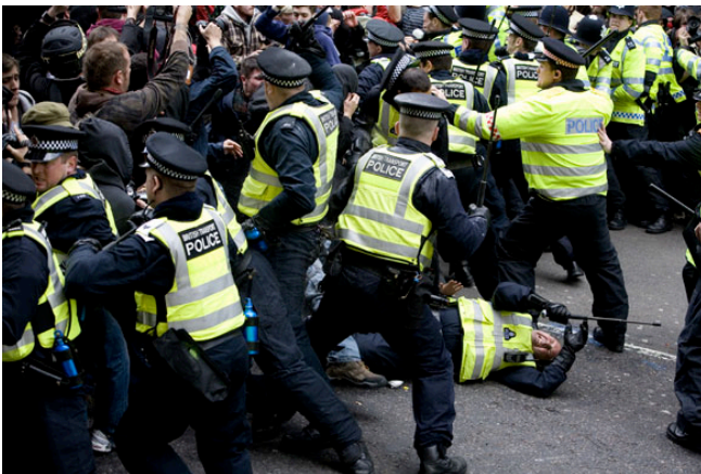
Figure 2. Two examples of threatening photographs.